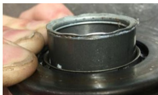
Damaged Piston Stop