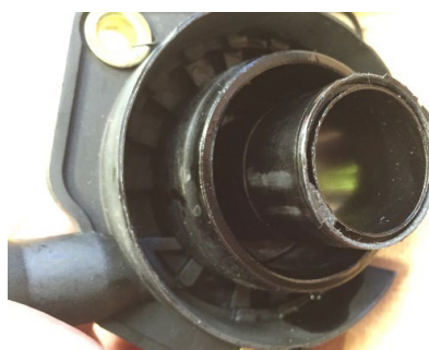
Off Axis Wear On Guide Tube