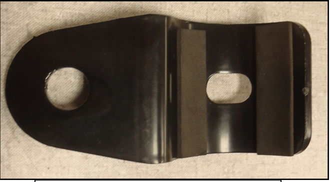
(Fig 7) Foam tape applied to light tab