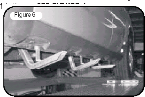
STEP 9. In location 4, under the vehicle there is one access hole on the floorboard of the vehicle. Use this hole and insert the 1/2" anchor bolt, then hang the rear bracket in place using 1/2" nut and lock washer. SEE