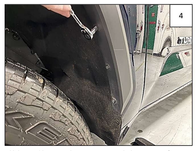
Using a 10mm socket, remove top bolt on rear of rear wheel well as shown.