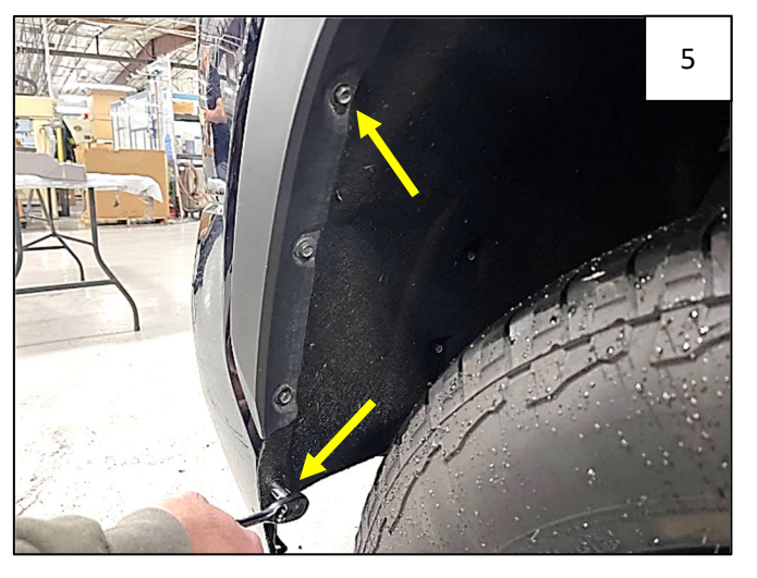
Using a 10mm socket, remove bottom and top bolt from front of wheel well as shown.