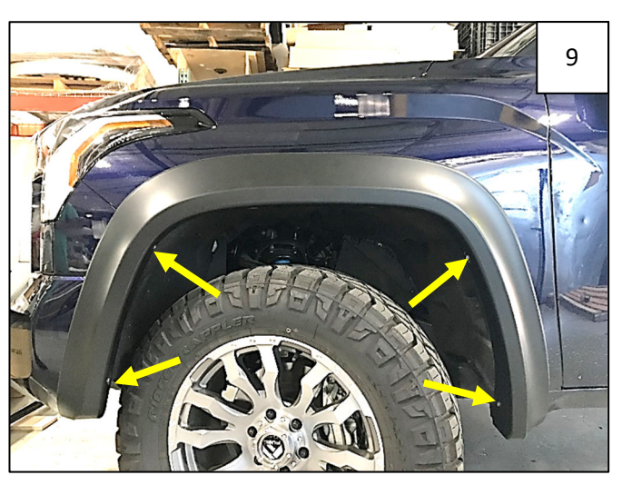
Hold front flare firmly on vehicle and start 4 factory fasteners in through holes in flare and into factory holes as shown.