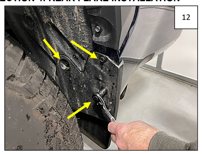
Using a 10mm socket, remove 3 factory fasteners from mud guard. Retain all screws for future use. NOTE: Some screws will not be used.