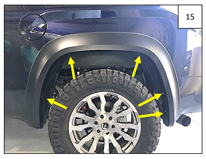
Hold flare firmly on fender and start factory screws through 5 holes in flare and into holes in fender.