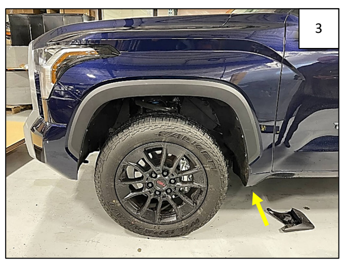
Using a 10mm socket, remove 1 factory fastener from underside of mud guard.