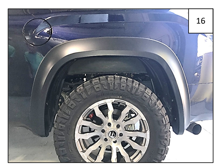
Apply pressure to flare towards vehicle body at each fastening point and tighten all fasteners.