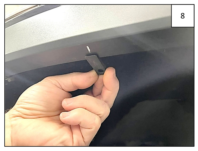
Place a supplied Clip over each mark made in Step 6 (2 places). Make sure hole in clip does not go past edge of fender lip.