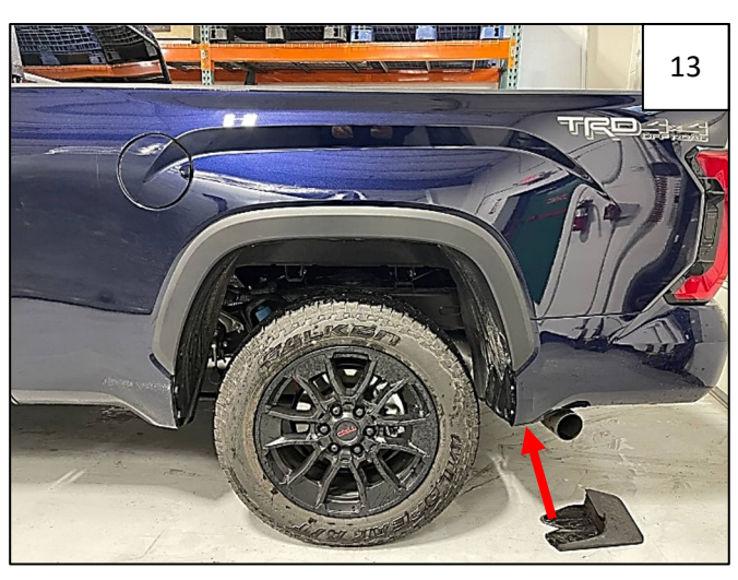
Using a 10mm socket, remove 1 factory fastener from underside of mud guard.