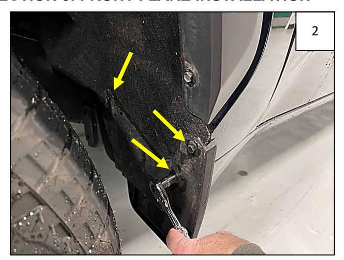
Using a 10mm socket, remove 3 factory fasteners from mud guard. Retain all screws for future use. NOTE: Some screws will not be used.