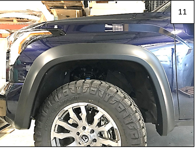
Apply pressure to flare towards vehicle body at each fastening point and tighten all fasteners.