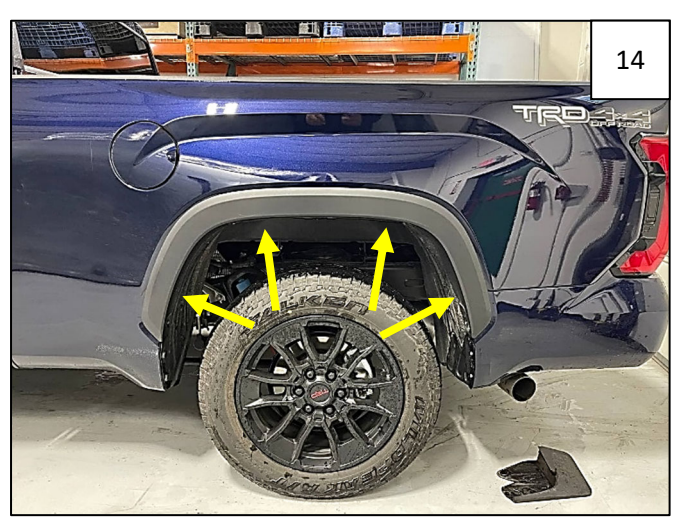
Remove all 4 bolts from factory wheel well molding.