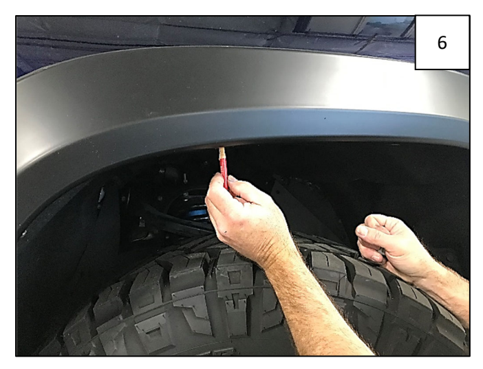
Hold flare firmly on fender and mark 2 top holes with a grease pencil.