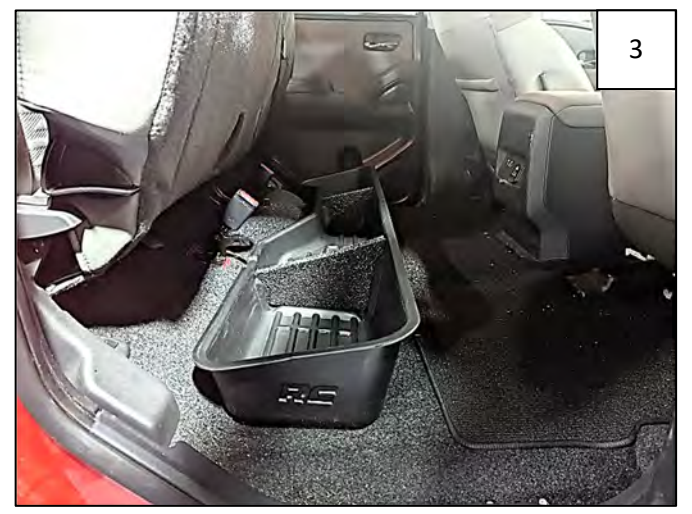
Place the Underseat Storage Box as shown. Strap slots should face rear of vehicle. Front of Underseat Storage Box is taller than rear.