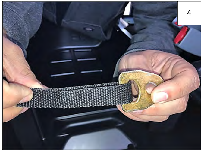
Feed Safety Strap through the wide slot in the supplied Metal Bracket.