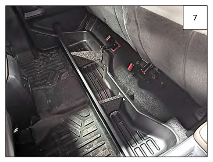
Install Foam Dividers in molded-in slots in Underseat Storage Box.