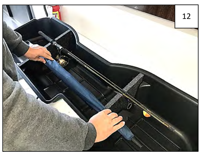
Lay long items in Underseat Storage Box as shown, pressing into the cutouts in the foam.