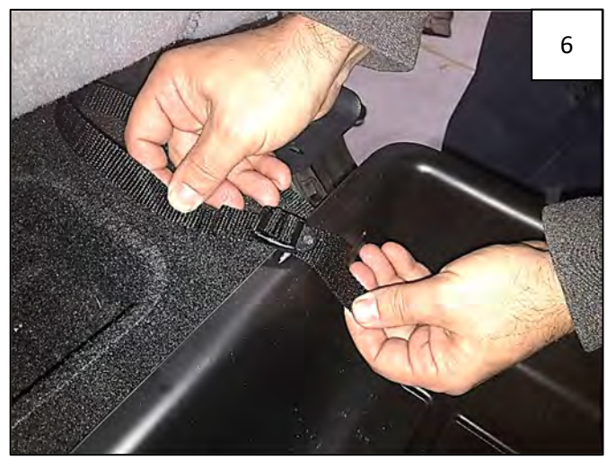
Thread buckle onto one end of safety strap. Feed other end of Safety Strap into Buckle and tighten to anchor Underseat Storage Box in place.