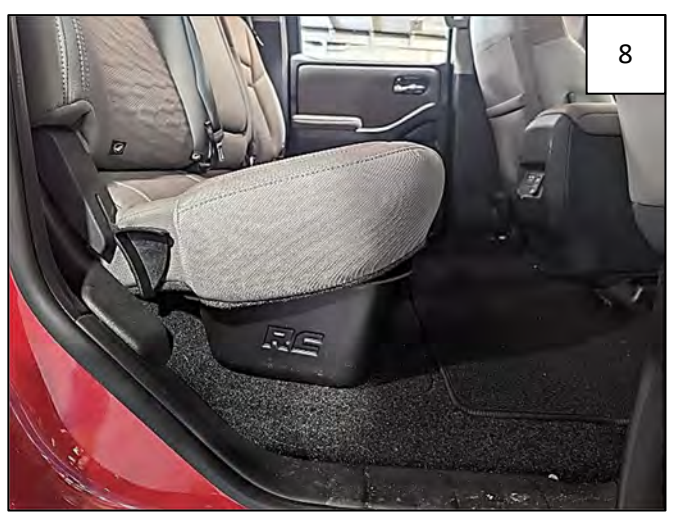
Complete Underseat Storage Box installation.