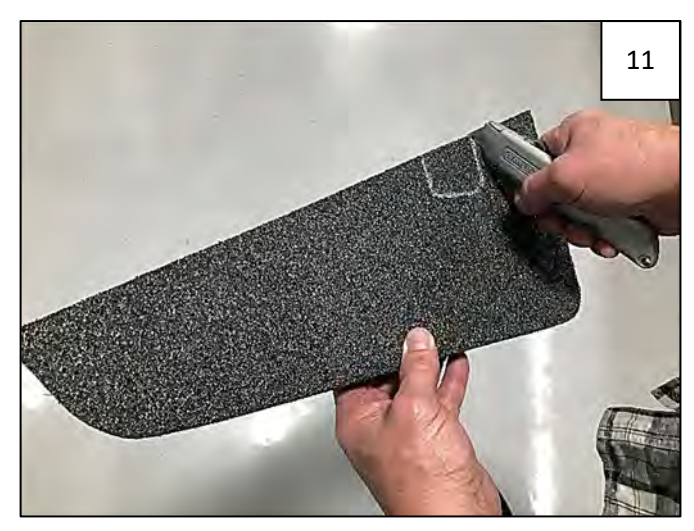
Use a utility knife to carefully cut the corresponding section out of each Foam Divider.