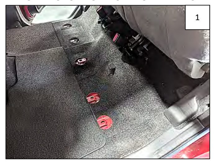
Lift the rear seat for installation of Underseat Storage Box.