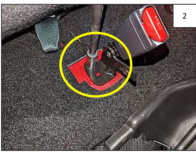
Using a 14mm socket, remove bolt at base of seat belt bracket under seat (1 place).