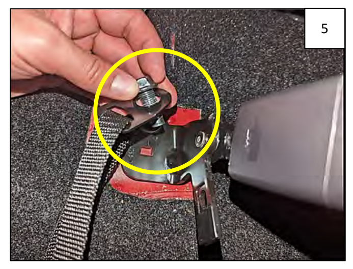
Slide Metal Bracket-Strap combo over bolt removed in Step 2. Reinstall bolt.