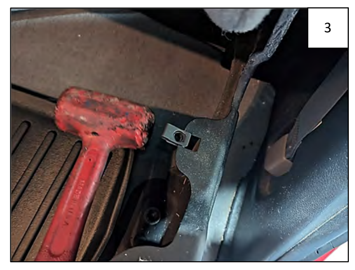
Use a deadblow/rubber hammer to align hole in clip with square hole.