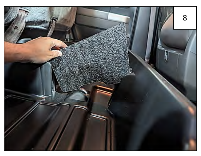
Install Passenger Side Foam Divider into molded-in slot in Underseat Storage Box.