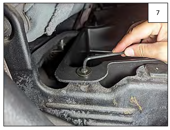
Holding bushing in place, insert Buttonhead Bolt through hole in Underseat Storage box and Bushing and thread into clip. Use a 3/16" Allen Wrench to tighten.