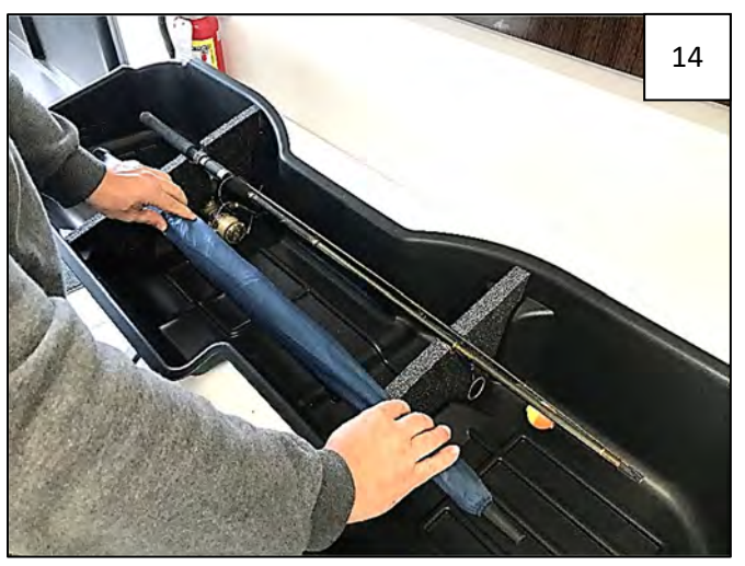
Lay long items in Underseat Storage Box as shown, pressing into the cutouts in the foam.