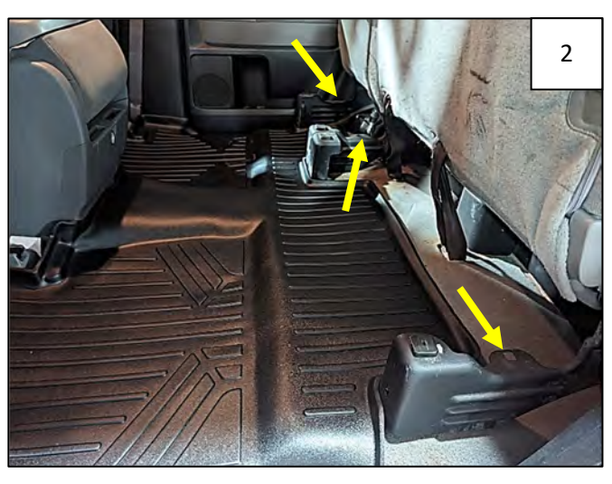
Slide 3 supplied Body Clip Nuts over square holes in seat support brackets indicated by arrows.