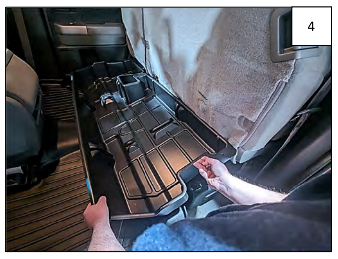
Place the underseat Storage Box on the floor, aligning holes in Box with clips installed in Steps 2-3.