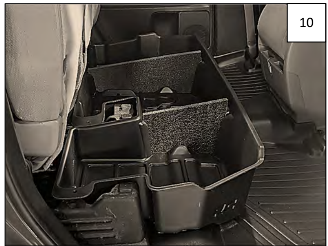
Complete Underseat Storage Box installation.