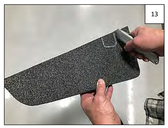
Use a utility knife to carefully cut the corresponding section out of each Foam Divider.