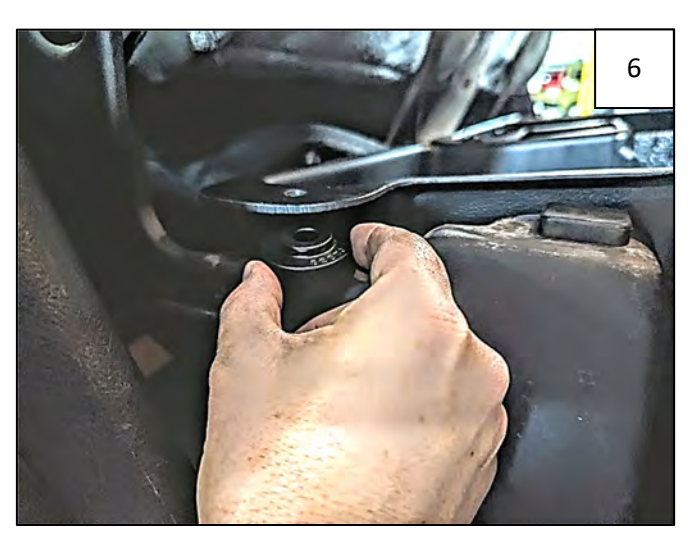
Slide a supplied Bushing between Underseat Storage Box and Clip.