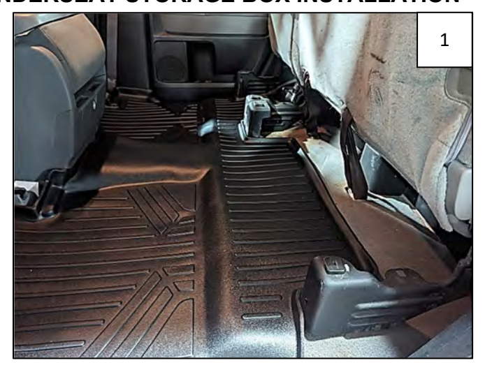
Lift the rear seat for installation of Underseat Storage Box.