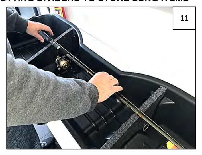
If you want to store long items lengthwise in the Underseat Storage Box, lay the item in the Box (over the top of the dividers) in the position you would like to store it in. Alternately, you may remove the dividers and skip the next steps, however, items may shift in transit.