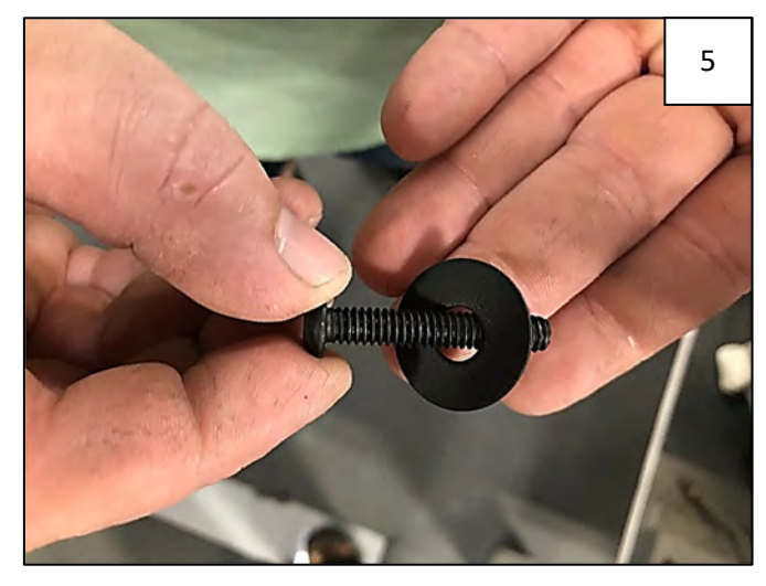
Install a supplied Flat Washer onto each supplied Buttonhead Bolt.