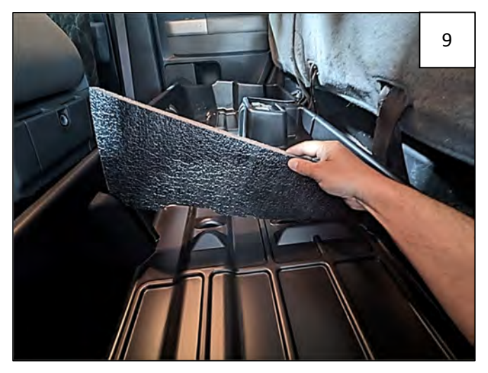
Install Driver Side Foam Divider into molded-in slot in Underseat Storage Box.