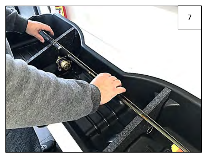
If you want to store long items lengthwise in the Underseat Storage Box, lay the item in the Box (over the top of the dividers) in the position you would like to store it in. Alternately, you may remove the dividers and skip the next steps, however, items may shift in transit.