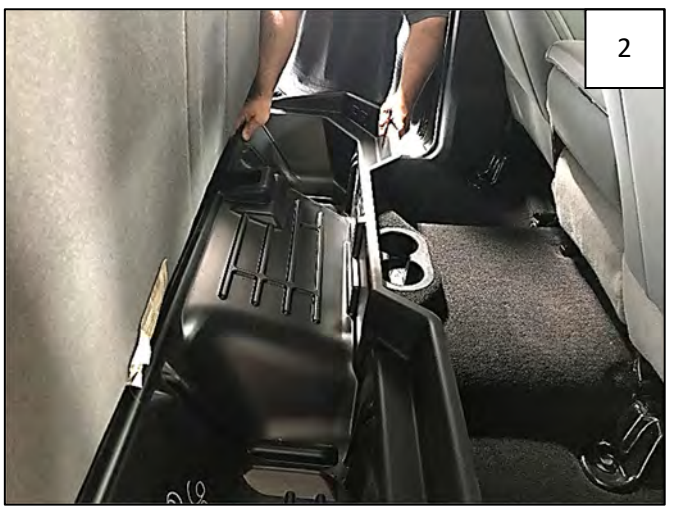
Nest the Underseat Storage Box into factory underseat indent. The driver's side of the Storage Box should slide underneath seat cushion stop as shown in next step.