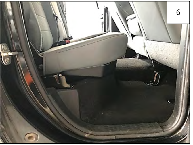
Lower Seat into place. Underseat Storage Box installation is complete.