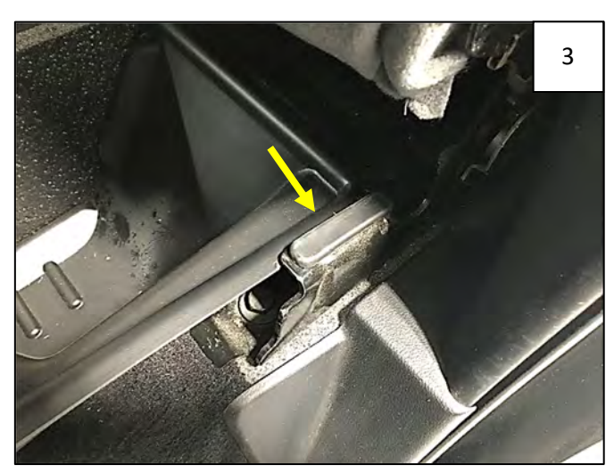
Make sure the driver side edge of Underseat Storage Box is guided under seat cushion stop.