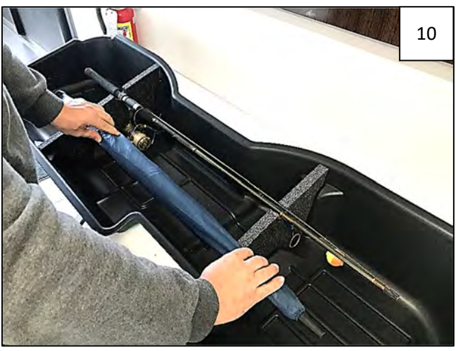
Lay long items in Underseat Storage Box as shown, pressing into the cutouts in the foam.