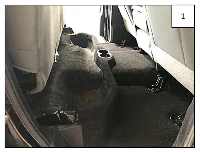
Lift the rear seat for installation of Underseat Storage Box.