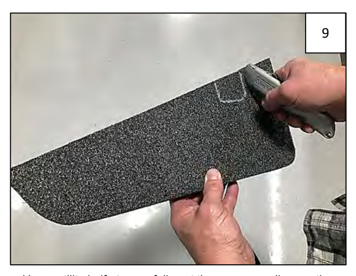
Use a utility knife to carefully cut the corresponding section out of each Foam Divider.