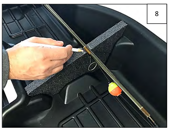
Use a marker or grease pencil to trace the width of the item on each Foam Divider. Remove item and trace the depth at which you would like the item to rest. NOTE: Cutouts should be fairly snug.