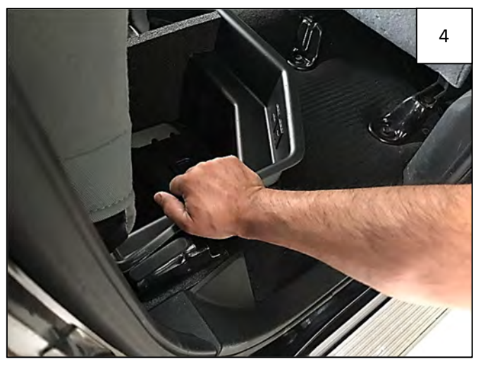
On passenger side, press edge of Underseat Storage Box to seat it underneath the passenger side seat cushion stop.