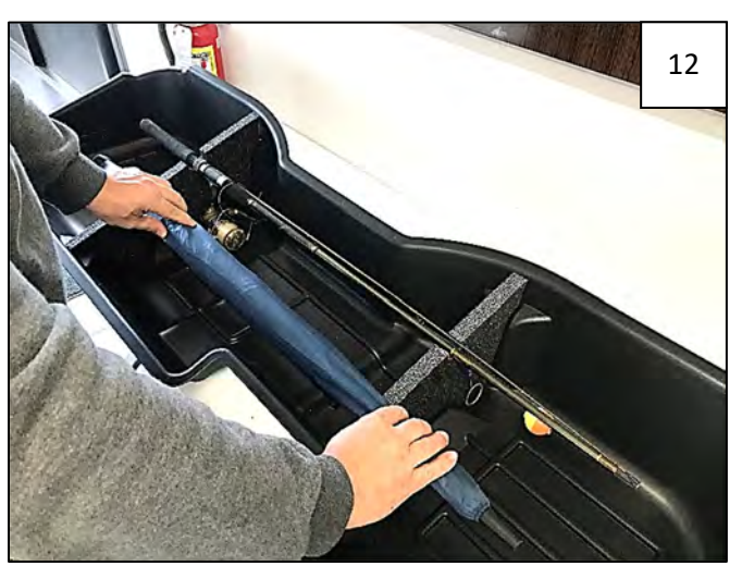
Lay long items in Underseat Storage Box as shown, pressing into the cutouts in the foam.