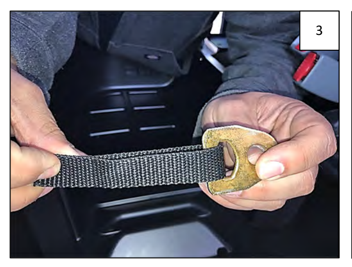
Feed one Safety Strap through the wide slot in each supplied Metal Bracket.