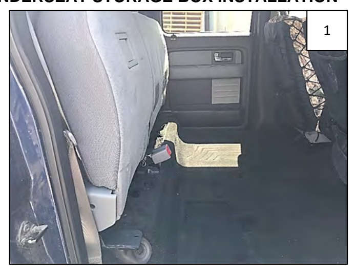
Lift the rear seat for installation of Underseat Storage Box.