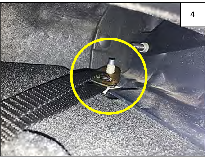
Slide a Metal Bracket-Step combo over each upright bolt located underneath seat closest to slots in rear of Underseat Storage Box.