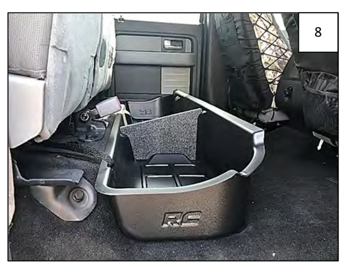
Complete Underseat Storage Box installation.