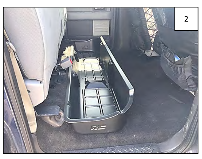
Place the Underseat Storage Box as shown. Strap slots should face rear of vehicle. Front of Underseat Storage Box is taller than rear.