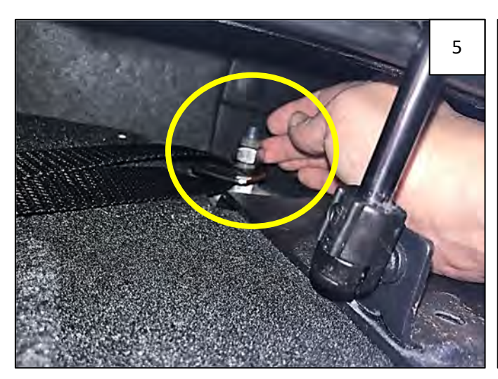
Thread a supplied Flange Nut onto each bolt. The nut does not need to be wrench-tight, but should be securely threaded down to the Metal Bracket.