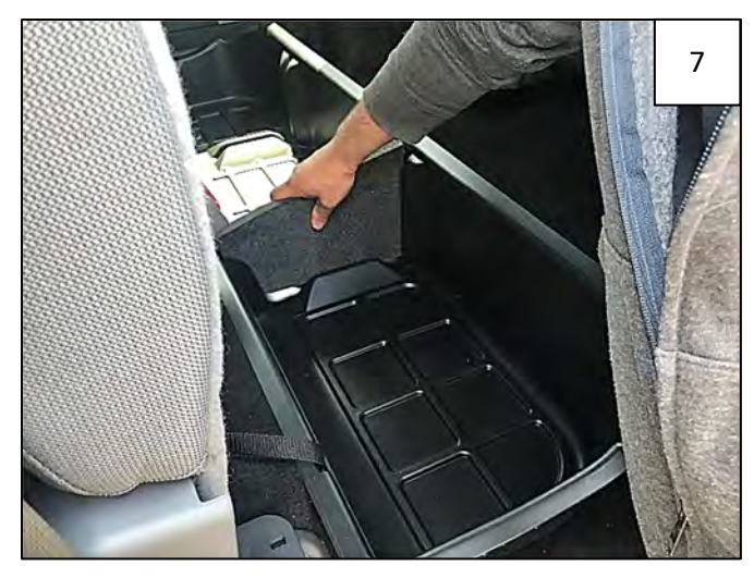
Install Foam Dividers in molded-in slots in Underseat Storage Box.