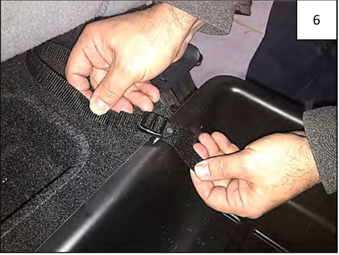
Thread one buckle onto one end of each safety strap. Feed other end of Safety Strap into Buckle and tighten to anchor Underseat Storage Box in place.