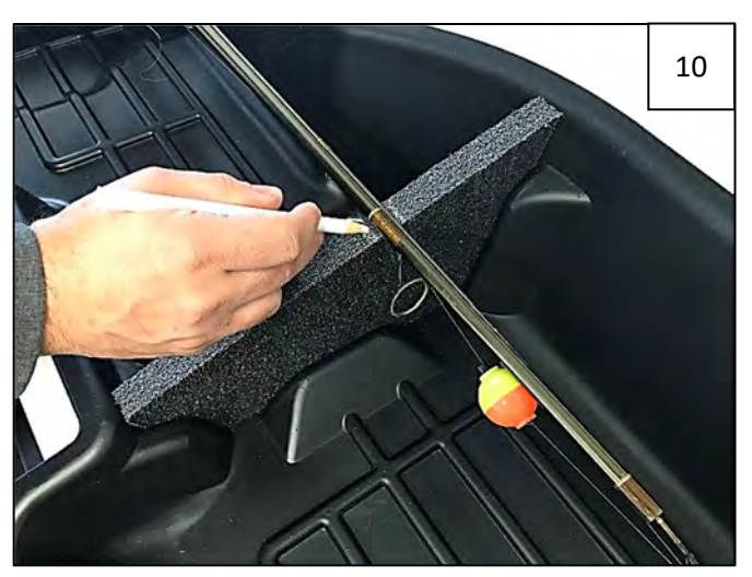
Use a marker or grease pencil to trace the width of the item on each Foam Divider. Remove item and trace the depth at which you would like the item to rest. NOTE: Cutouts should be fairly snug.