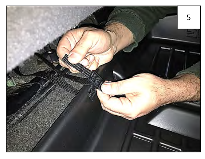
Feed other end of Safety Strap into Buckle and tighten.