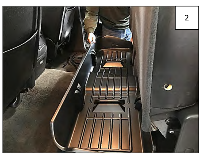
Place the Underseat Storage Box as shown. Strap slots should face rear of vehicle. Front of Underseat Storage Box is taller than rear.