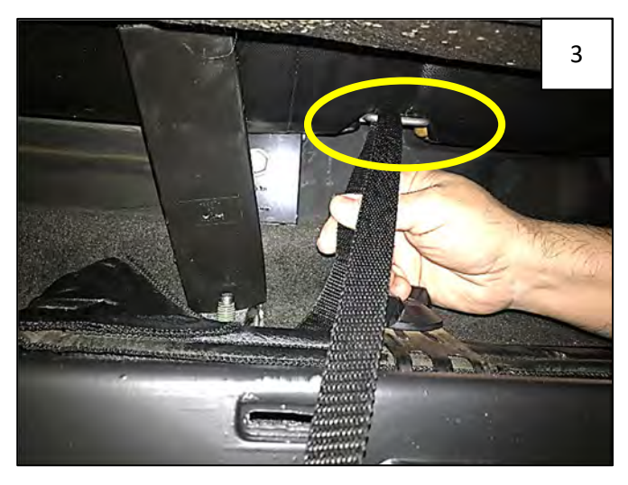
Loop one Safety Strap around metal loop located at underside of rear driver side seat.