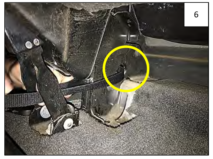
Loop other Safety Strap between seat belt sheaths and through 1" hole in strut under rear passenger side seat as shown.