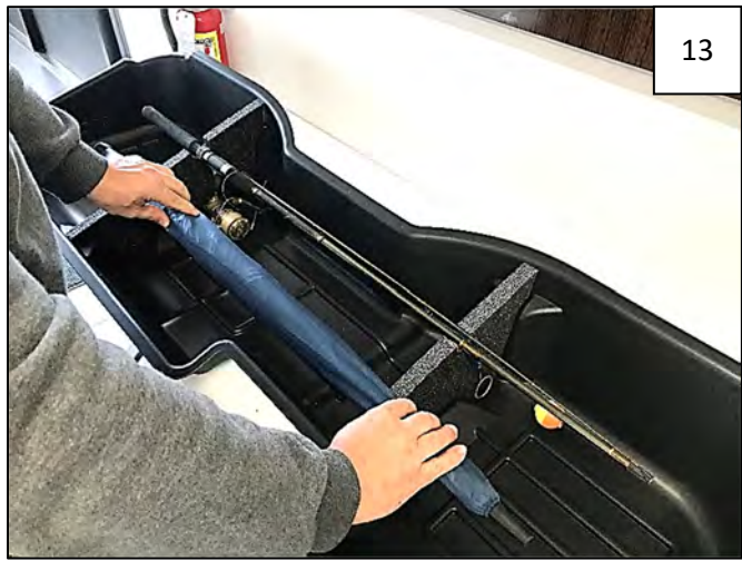
Lay long items in Underseat Storage Box as shown, pressing into the cutouts in the foam.