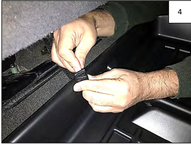
Feed a Safety Strap through driver side slot in Underseat Storage Box. Thread one Buckle on one end of Safety Strap.