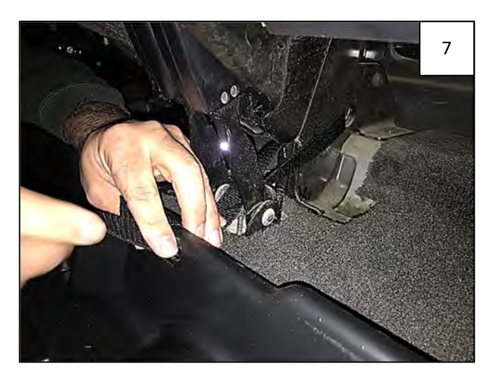
Feed Safety Strap through passenger side slot in Underseat Storage Box. Thread one Buckle on one end of Safety Strap.