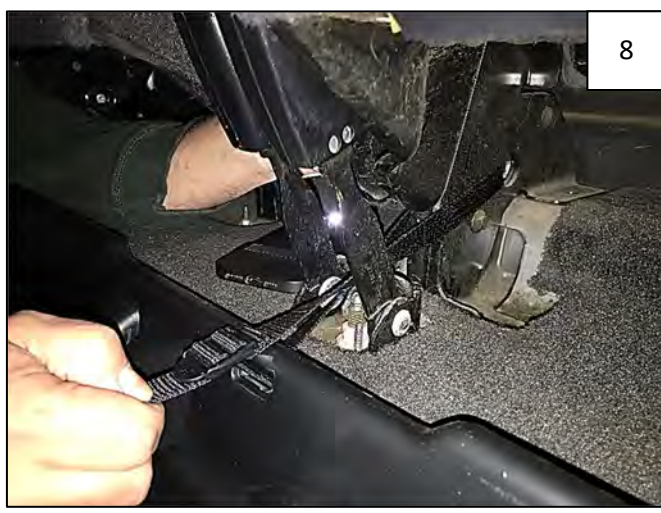
Feed other end of Safety Strap into Buckle and tighten.