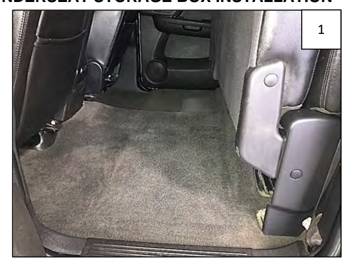
Lift the rear seat for installation of Underseat Storage Box.