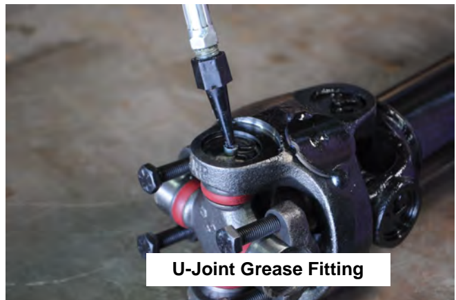
U-Joint Grease Fitting