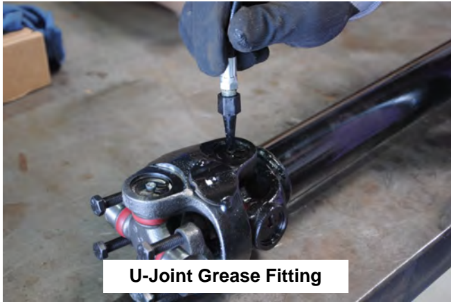
U-Joint Grease Fitting