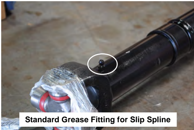
Standard Grease Fitting for Slip Spline