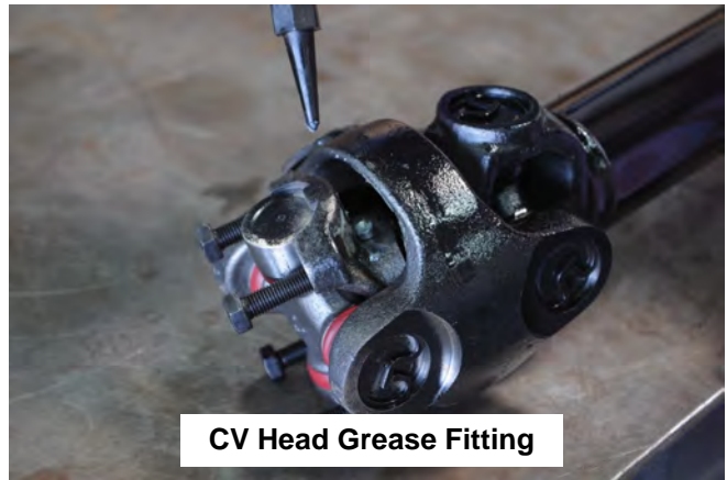
CV Head Grease Fitting