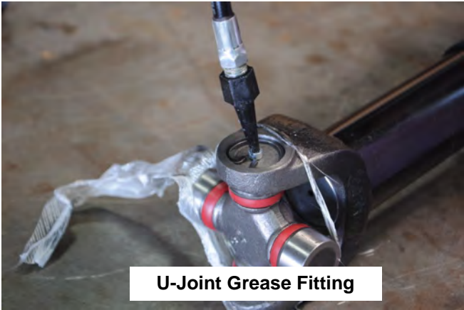
U-Joint Grease Fitting