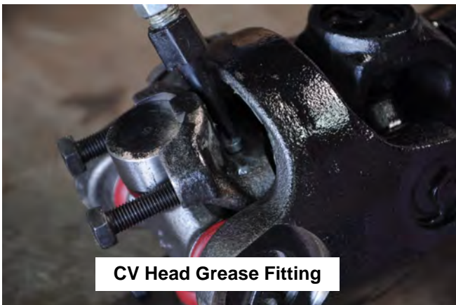
CV Head Grease Fitting