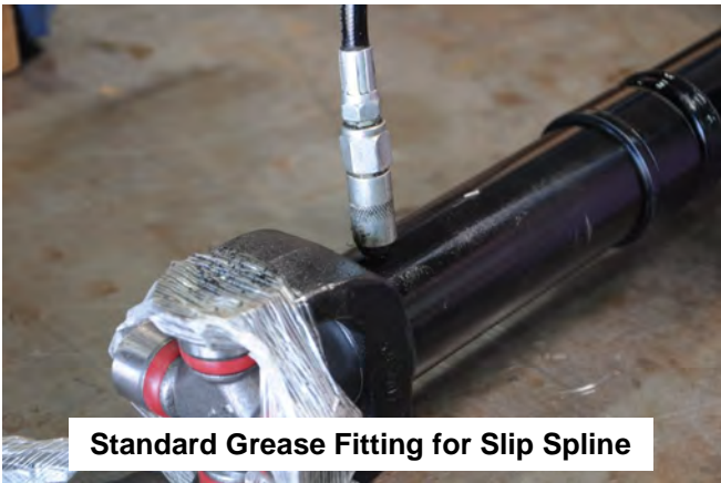
Standard Grease Fitting for Slip Spline