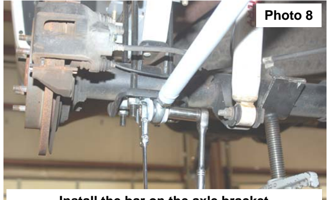
Install the bar on the axle bracket