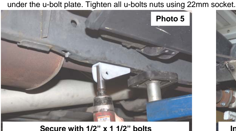
Secure with 1/2" x 1 1/2" bolts

Install traction bar bracket using the supplied 1/2" x 1 1/2" bolts and tighten bolts using 19mm socket. See Photo 5. 5. With rear end supported remove nuts from the u-bolts and install lower traction bar bracket as shown in Photo 6 6.