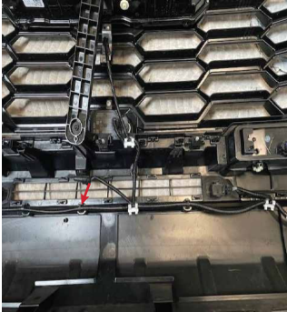
Before: (TRD Pro Grill Displayed)