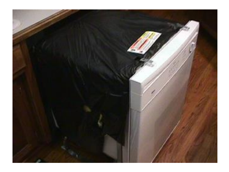
Step 2. Remove the insulation pad from the dishwasher.