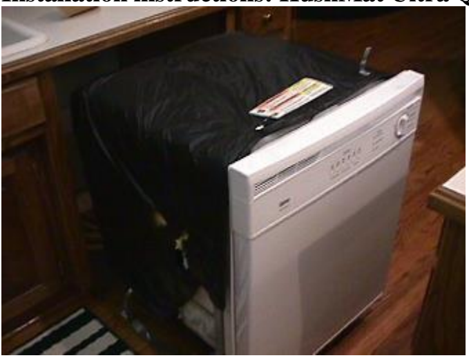
Step 6. Gently push the appliance back into the cabinet, bend the bracket back to the underside of the counter and reinstall the two holding screws. You' are now ready for peace and quiet.

Installation instructions: HushMat Ultra Quiet Kit on Dishwasher Applications