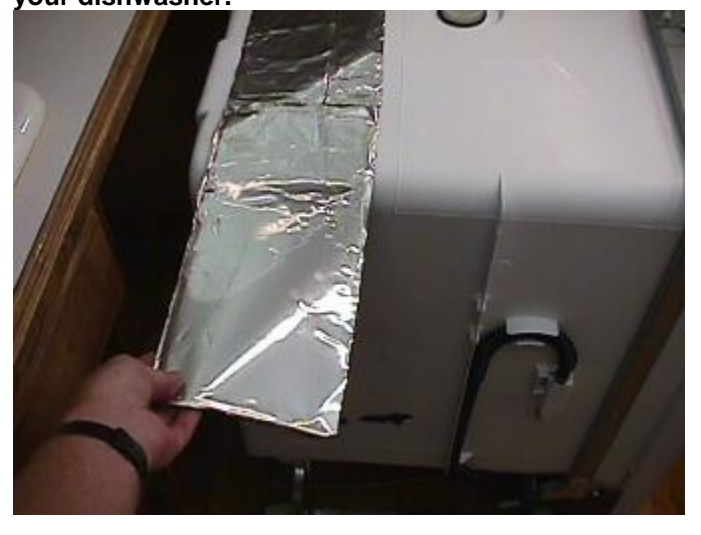
Step 4. After installation of the Ultra pads. Use Hushmat Quiet tape to reattach the insulation pad to the dishwasher as shown.

Step 3. Remove HushMat Ultra Sheets by peeling the release liner and place onto the body of the dishwasher. Be sure to place hand pressure across the total surface of the pads to assure proper adhesion. If required, use scissors to cut the material into smaller shapes to fit the contour of your dishwasher.