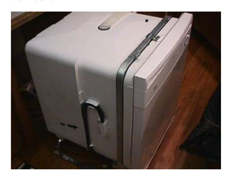
Lay the insulation pad to the side for later reinstallation.