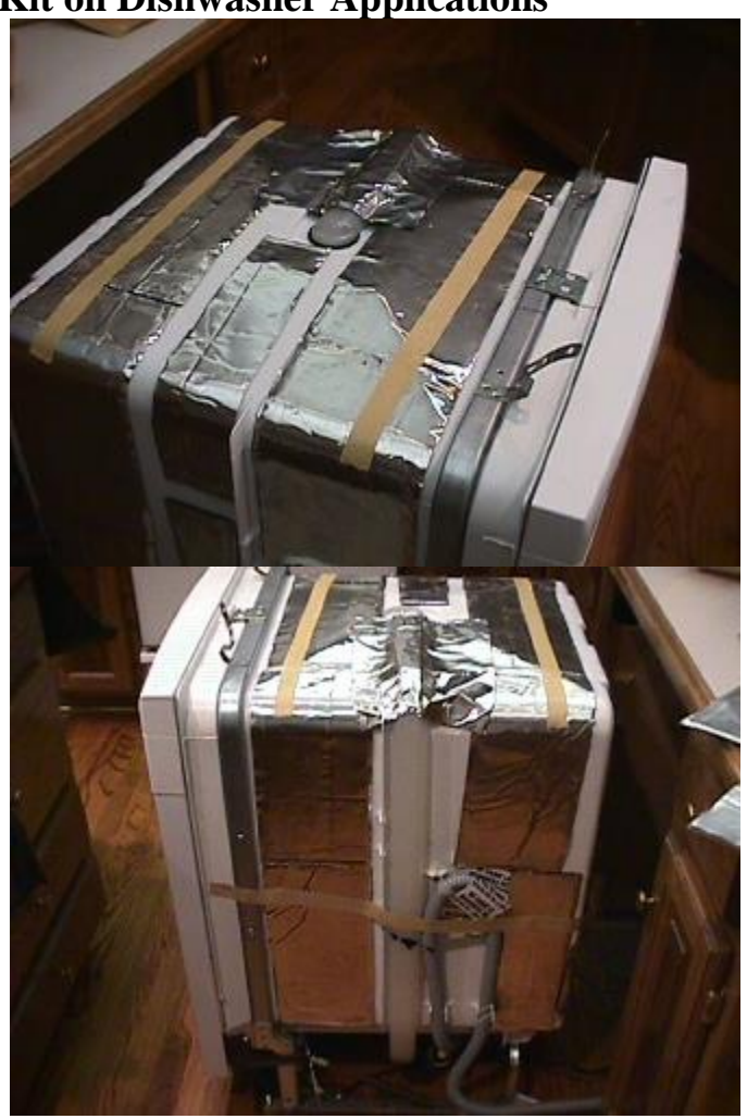
Step 5. Reinstall the insulation pad.