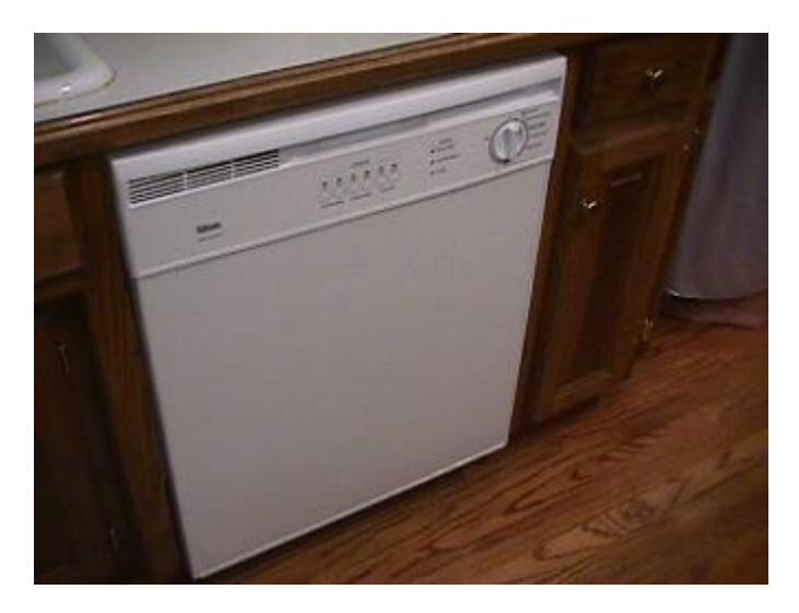
Step 1 - Remove dishwasher from cabinets.

Cabinet mount dishwashers have two screws under the counter lip, holding them in place. Remove these two screws and slightly bend downward the attaching brackets. This will prevent the bracket from catching the bottom of the counter surface and scratching the surface.