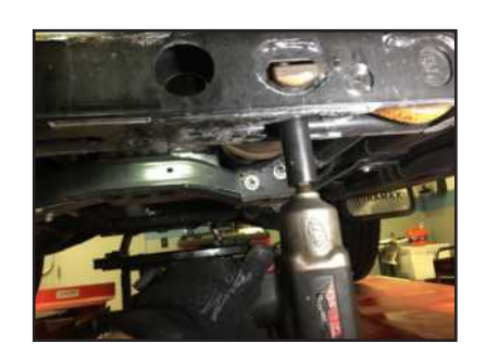
STEP 10: Remove both OEM Torsion key Adjusting Bolts.