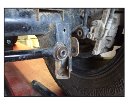
STEP 6: Remove rear shocks, and retain hardware for reinstallation.