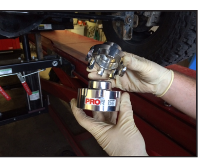
STEP 10: Install chosen spacers over bottom rear coil locator, and secure with included hardware, as shown.