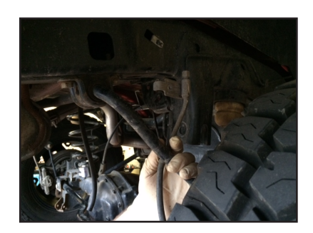
STEP 8: CAREFULLY

Install included multi-position track bar relocator to the frame using supplied hardware.