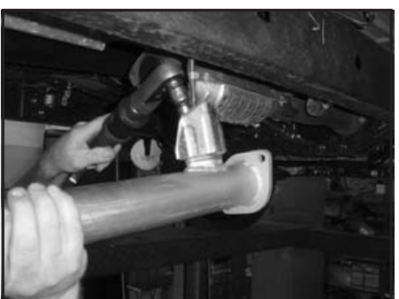
12. Install Oxygen sensor into new intermediate pipe (A) using factory 12mm hardware.