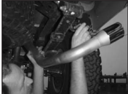
9. Install new tail pipe (C) by inserting the tail pipe hanger into the factory rubber isolator.