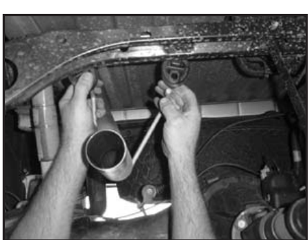
10. Insert front tail pipe hangers into factory rubber isolators.