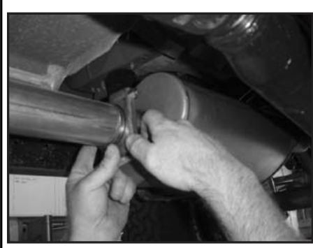
15. Insert intermediate pipe (A) into muffler (B) and install exhaust clamp (D) at the front of the muffler (B).