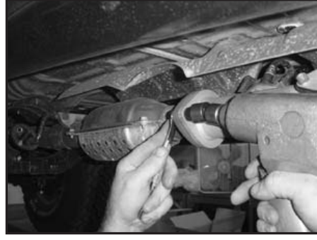
14. Using the 14mm wrench, socket, and ratchet, tighten the Catalytic Converter bolts and nuts.