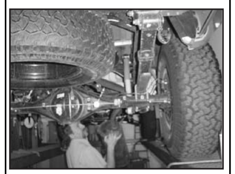
8. Remove factory exhaust from the vehicle.