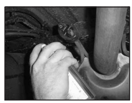
4. Spray penetrating oil on all factory rubber isolators.