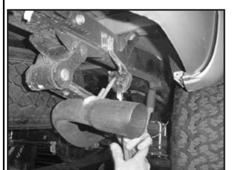
7. Remove tail pipe hanger from factory rubber isolator.