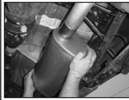
11. Slip muffler (B) into the tail pipe (C) as shown in the photo.