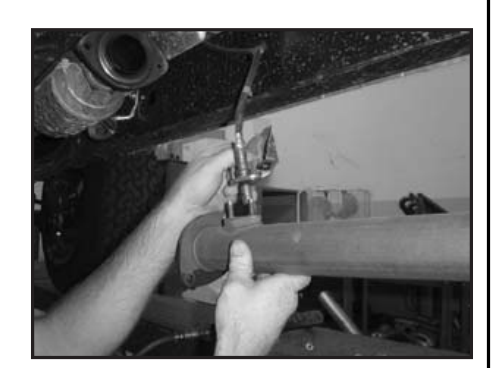
6. Using the 12mm socket and ratchet, remove the nuts that secure the Oxygen sensor to the intermediate pipe. Remove Oxygen sensor.