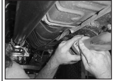
13. Install and secure the new intermediate pipe (A) into the vehicle by reinstalling the factory Catalytic Converter bolts and nuts.