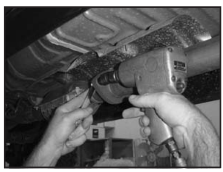
3. With the vehicle raised and properly supported, use the 14mm wrench, 14mm socket and ratchet to remove the bolts from the Catalytic Converter flange.