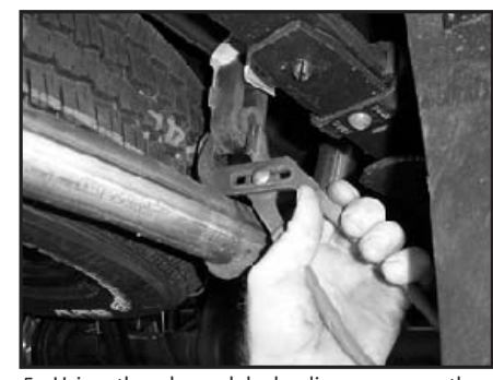
5. Using the channel lock pliers, remove the tail pipe hanger from the rubber isolator.