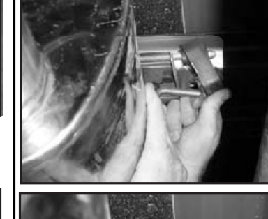
10. Insert hanger rods on the muffler into the