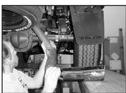
12. Install tailpipe (C).