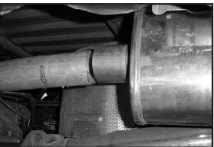
13. Insert tailpipe (C) into muffler (B).

1) It may be necessary to loosen and realign the spare tire for proper clearance.