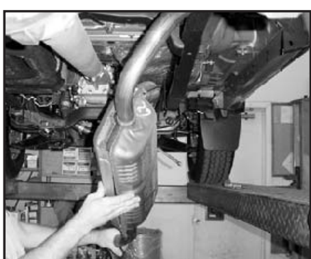
6. Remove the original exhaust system from