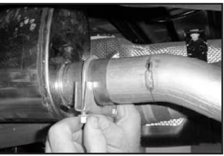
11. Attach clamp (E) to the front of the muffle