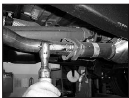
3. With the vehicle raised and properly supported, use a 15mm socket to remove the bolts that attach the exhaust system to the Catalytic converter.