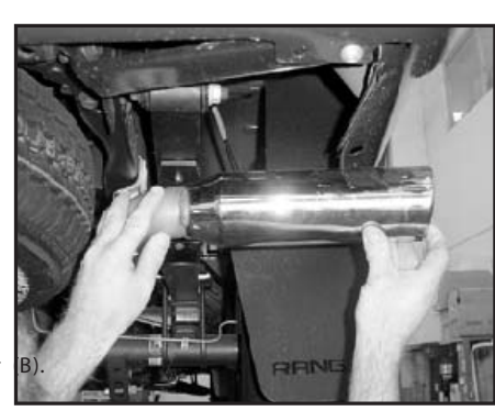
16. Align tail pipe (C). tighten clamp (D).