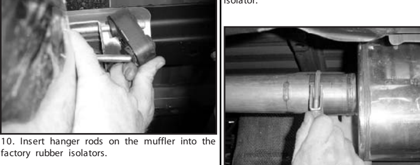
15. Install clamp (D) onto rear of muffler (#).