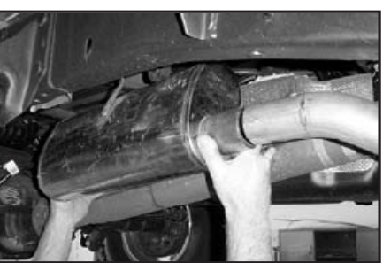
9. Slip muffler (B) onto intermediate pipe (A).