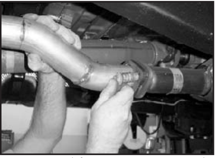
7. Using original fasteners, connect intermediat pipe (A) to the factory catalytic converter pipe.