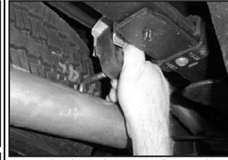
14. Install tail pipe hanger into factory rubber