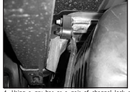
4. Using a pry bar or a pair of channel lock p remove hangers from rubber isolators at the to of the muffler.