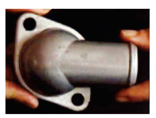
After 60,000 miles with the Sacrificial Anode Radiator Cap patented technology the effects of electrolysis that can ultimately destroy the entire cooling system are dramatically reduced.