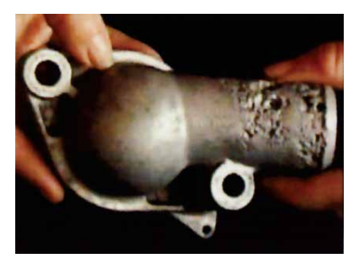
Without Sacrificial Anode Radiator Cap, the thermostat housing cover shows major deterioration after 60,000 miles.