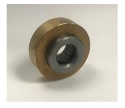
PBG-00104A Used with LS Engines