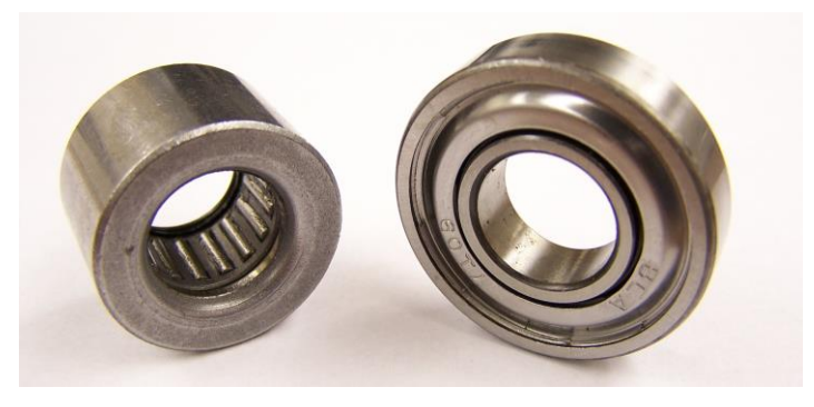
CHEVROLET PILOT BRG.

NOTE: The pilot bearing holes in some crankshafts are not sized consistently. The pilot bearing is designed to be a slight press fit in the bore. Your pilot bearing OD should be between one-half of a thousandth and two thousandths of an inch (0.0005" - 0.002") larger than the ID of the hole in your crankshaft. If outside of this range, a different pilot bearing is required, or your crankshaft or pilot bearing may be modified to fit. Contact your local parts store or machine shop for a suitable replacement or to modify your existing parts.