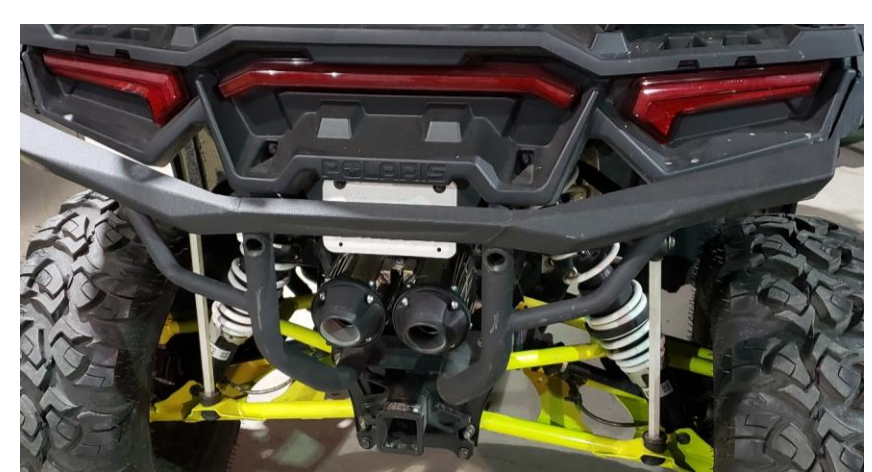
Congratulations! You are ready to begin experiencing the improved performance and driving excitement of your MBRP Ltd. Exhaust upgrade. We know you will enjoy your purchase.

It is recommended that the hardware be retightened after the first ride and checked periodically thereafter, tightening if necessary. To maintain optimal performance, the spark arrestor screens should be cleaned after every 30-35 hours of use. To access the spark arrestors, remove the four (4) screws securing each muffler tip.