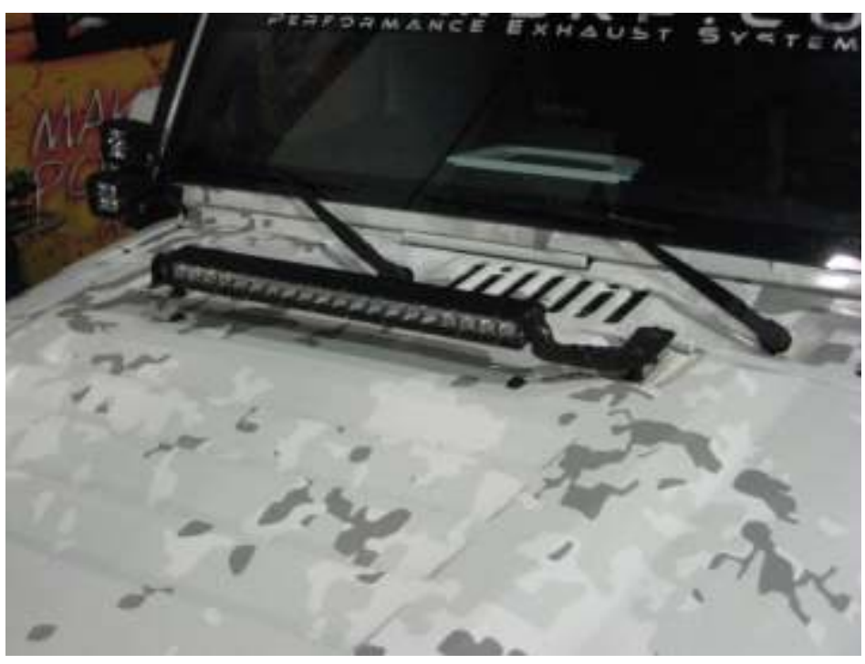
Congratulations! You're finished! We are sure that you will enjoy this Off Camber Fabrications product by MBRP Inc.