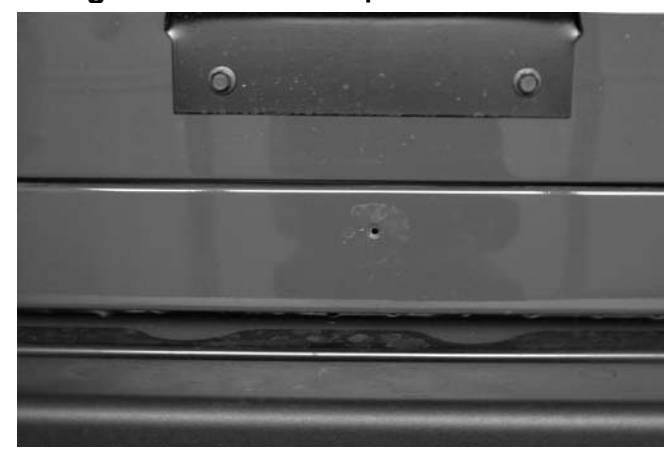
Figure #4 – Remove Tire Stop