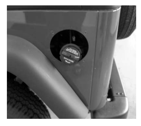
Figure #1 - Remove Gas Tank Outer Flange