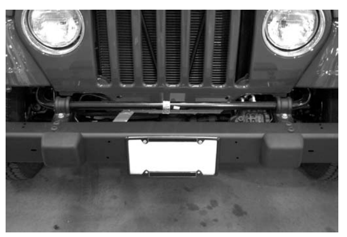
Figure #8 – Factory Front Panel Removed