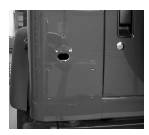
Figure #2 - Remove Tail Light & License Plate