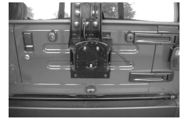
Figure #3 - Remove Spare Tire