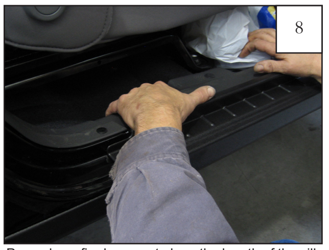
Press down firmly on part along the length of the sill.