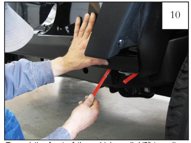
Toward the front of the vehicle, pull 1/2" tape liner tab 4. Press firmly on the part following tape liner removal. NOTE: Refer to step 1 for additional tape tab identification.