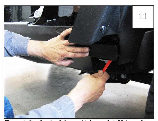
Toward the front of the vehicle, pull 1/2" tape liner tab 5. Press firmly on the part following tape liner removal. NOTE: Refer to step 1 for additional tape tab identification.