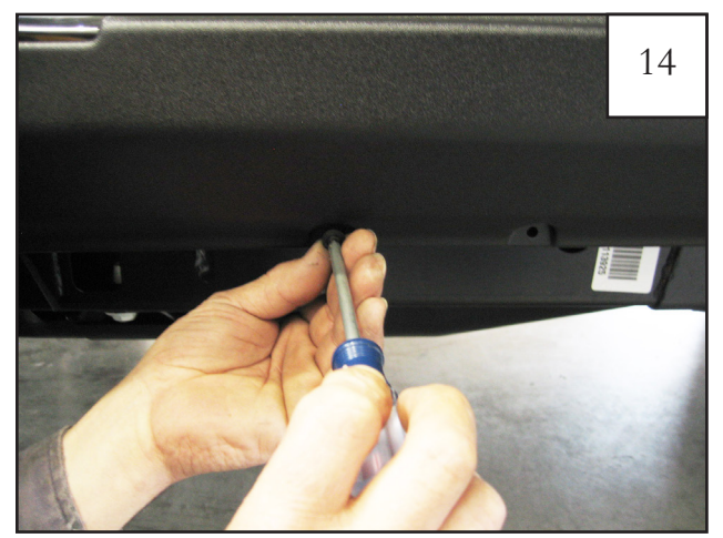
Using a #2 Phillips screwdriver, start a screw through each hole in side panel and through clips installed in step 4. Once all screws are started, tighten.