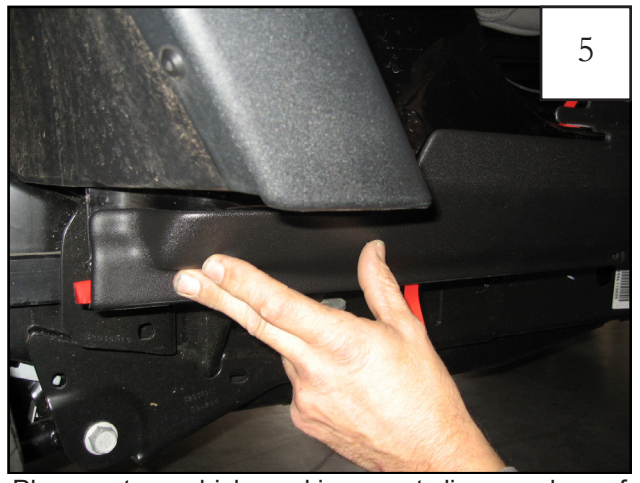
Place part on vehicle, making sure to line up edges of part with edges of vehicle. Ensure that all tape tabs are accessible. NOTE: Refer to step 1 for placement of certain tabs.