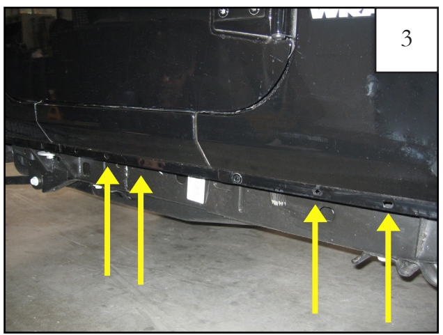
Locate the four factory holes in the rocker.