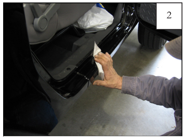
Open vehicle door. Clean all dirt and debris from vehicle then use supplied alcohol wipe where part will be. NOTE: Temperature should be at least 60°F for proper tape adhesion.