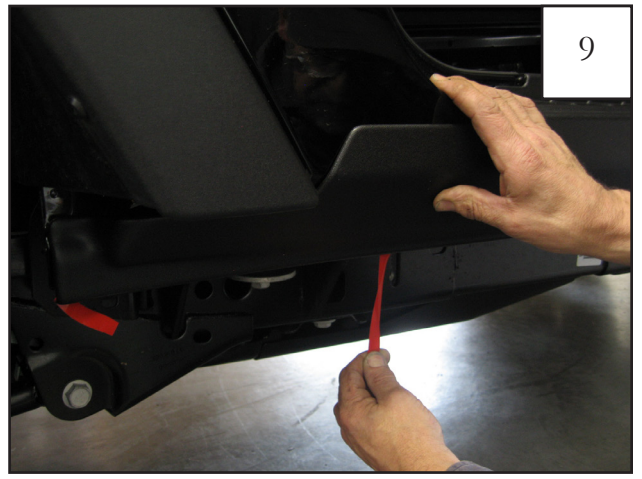
Toward the rear of the vehicle, pull 1/2" tape liner tab 3. Press firmly on the part following tape liner removal. NOTE: Refer to step 1 for additional tape tab identification.