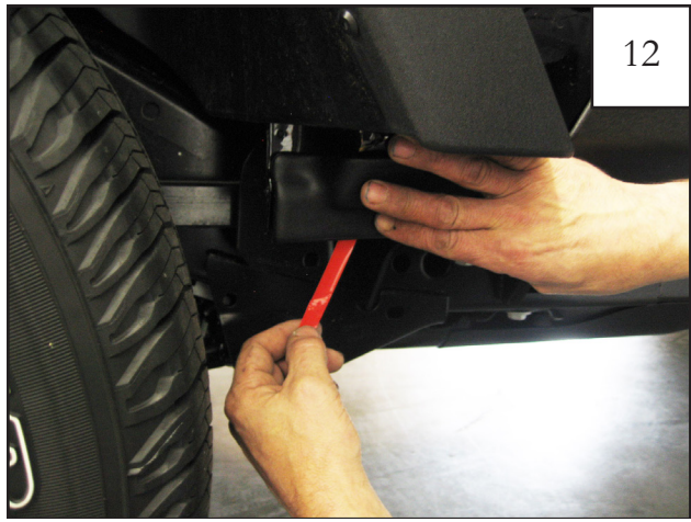
Toward the rear of the vehicle, pull 1/2" tape liner tab 6. Press firmly on the part following tape liner removal. NOTE: Refer to step 1 for additional tape tab identification.