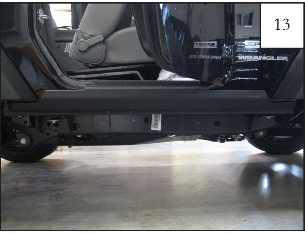
Once all tape liners are peeled, press down on entire length of part again applying 30 PSI to the taped areas. NOTE: The tape reaches maximum adhesive bond after 24 hours of contact. Do not wash vehicle for 24 hours.