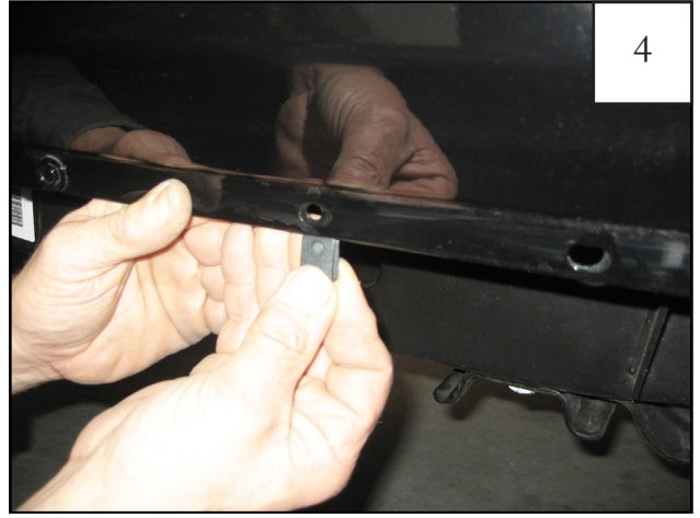
Place a clip over each hole with threaded portion of clip on the inside.