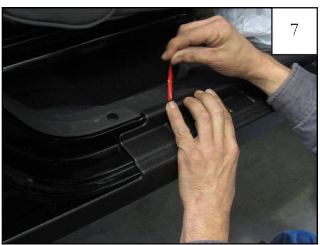
Pull 1/4" tape liner tab 2. NOTE: Refer to step 1 for additional tape tab identification.