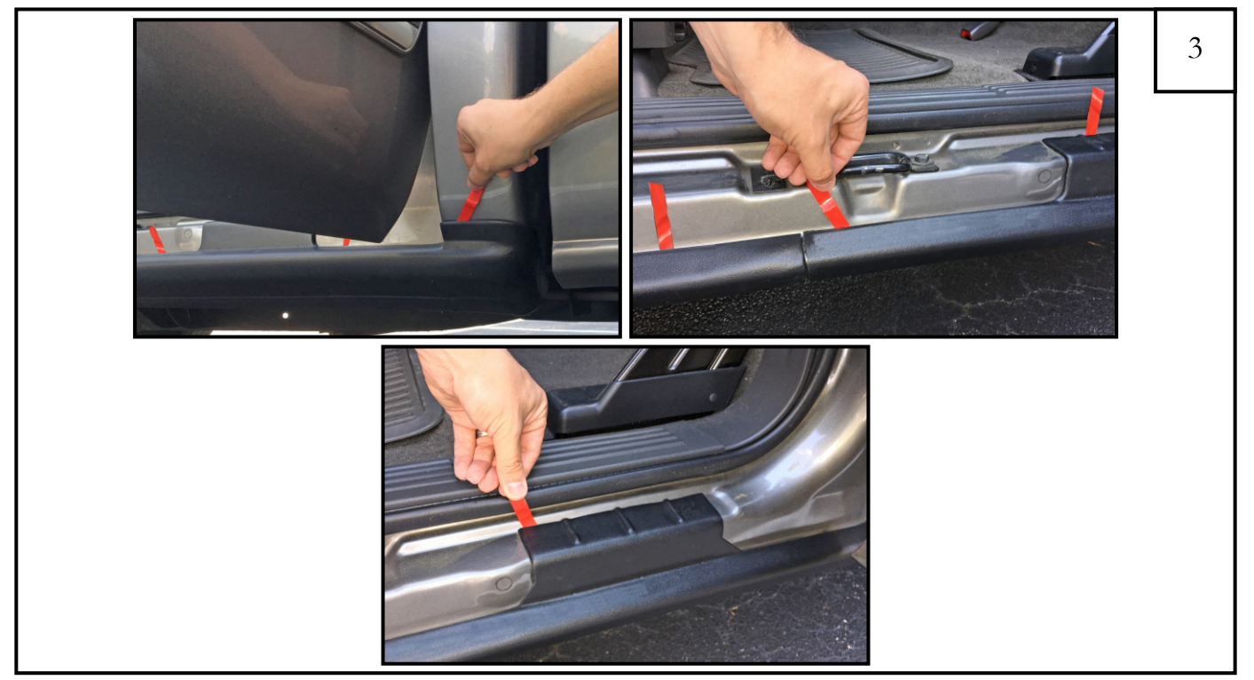
Set part in place on vehicle. Remove all red tape liners. Do not forget tape liners on bottom of part. Apply FIRM pressure to mounting locations to affix to truck.

Note that there is a strip of tape under the sill plate.