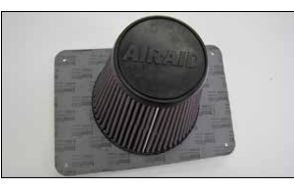
11. Place the housing lid gasket onto the lid and then install the AIRAID® air filter and secure with the provided hose clamp.