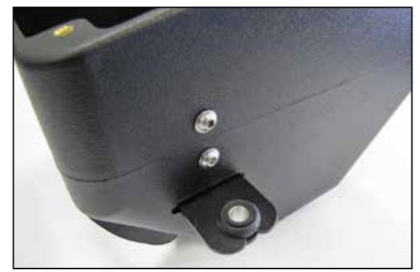
8. Install the grommet and sleeve from the previous step into the provided mounting bracket, then install the mounting bracket through the AIRAID® air filter housing and secure with the provided hardware.