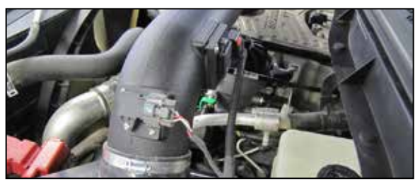
19. Reconnect the mass air and temperature sensor electrical connections.