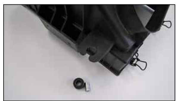
7. Remove the factory grommet and sleeve from the factory lower air filter housing.