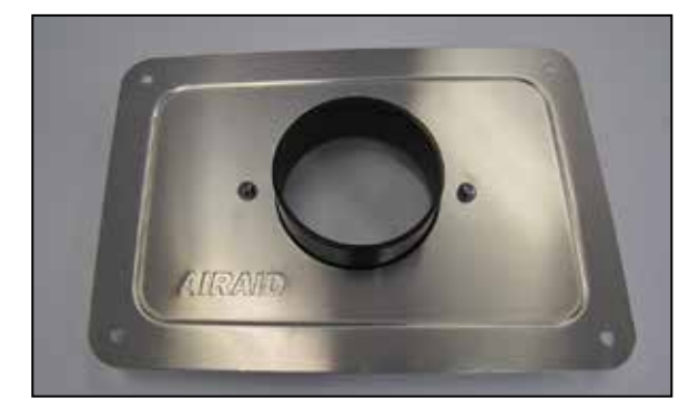
10. Install the filter adapter onto the air filter housing lid and secure with the provided hardware.

NOTE: Due to manufacturer tolerances, it may be necessary to use the provided tie wrap to secure the factory A/C line so that it does not rub the AIRAID air filter housing.