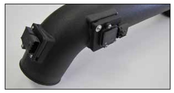
17. Install the sensor assemblies into the AIRAID® intake tube and secure with the provided hardware. NOTE: Be sure the mass air sensor is installed in the correct direction.