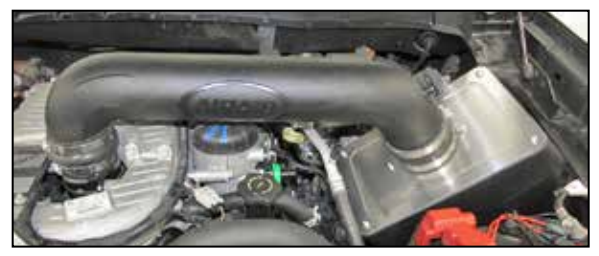
18. Install the AIRAID® intake tube assembly into the coupler at the turbo and filter adapter, adjust the tube for best fit and then secure with the provided hose clamps.