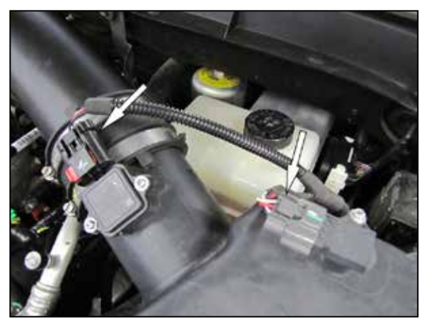
2. Disconnect the mass air sensor and inlet air temperature sensor electrical connections.

3. Loosen the hose clamp that secures the factory intake tube to the turbo inlet. Release the clips that secure the upper air filter housing to the lower housing and then remove the upper housing and intake tube from the vehicle.