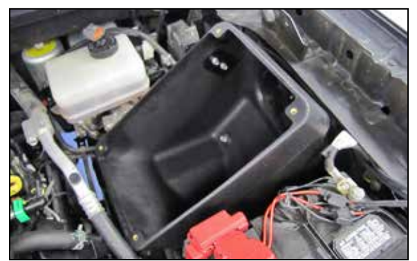
9. Install the AIRAID<sup>®</sup> air filter housing onto the mounting studs on the inner fender and secure with the factory bolt removed in step #4.

NOTE: Due to manufacturer tolerances, it may be necessary to use the provided tie wrap to secure the factory A/C line so that it does not rub the AIRAID air filter housing.