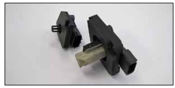
16. Install the factory sensors into the provided sensor adapters and then install the provided gaskets onto the adapters.