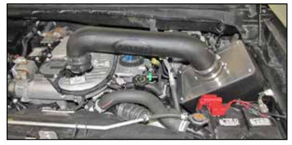
20. Double check your work! Make sure there is no foreign material in the intake path. Make sure all clamps, hoses, bolts, and screws are tight. Double check the hood clearance! Reconnect the negative battery cable!

Thank you for purchasing the Airaid Intake System. Contact Airaid @ (800) 498-6951 8:00 AM - 5:00 PM MST weekdays for questions regarding fit or instructions that are not clear to you. Your Airaid Intake System was carefully inspected and packaged. Check that no parts are missing, or were damaged during shipping. If any parts are missing, contact Airaid. The air filter element is protected from direct exposure to water and debris; care should be taken not to drive through deep water. WATER INGESTION IS THE DRIVERS RESPONSIBILITY! The air filter is reusable and should be cleaned periodically.