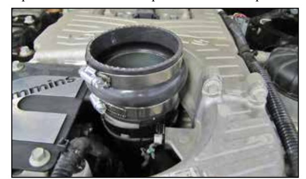
14. Install the provided hump coupler onto the turbo inlet and secure with the provided hose clamp.

13. Install the provided step coupler onto the filter adapter and secure with the provided hose clamp.