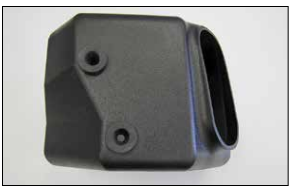
6. Remove the two mounting grommets from the factory lower air filter housing and install them into the AIRAID<sup>®</sup> housing as shown.

5. Remove the gasket from the factory fresh air intake.