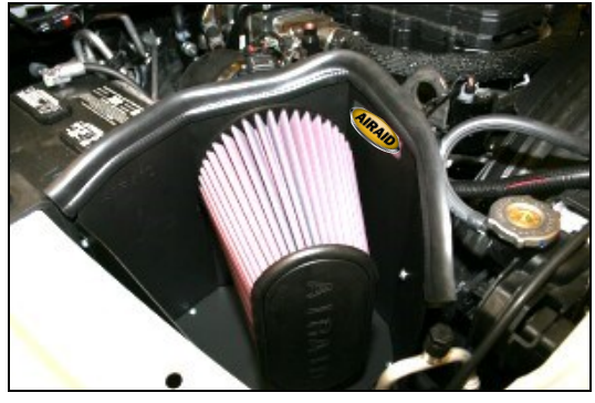
15. Install the Airaid Premium Filter (#1) onto the Airaid filter adapter, and tighten the hose clamp. Install the weather strip (#7) onto the top of the CAD , starting at the fender, and working your way towards the radiator.