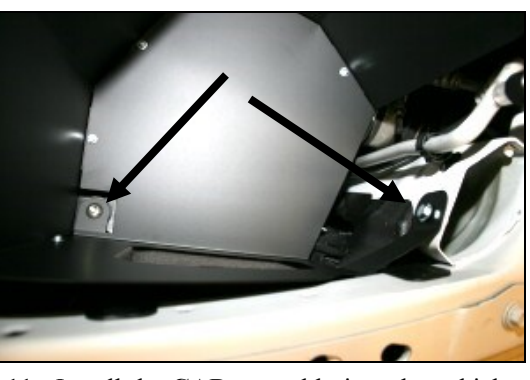
11. Install the CAD assembly into the vehicle, and install the 3/8-16x1 1/4" button head bolt (#18) thru the panel, and into the well nut. Next install the 6x1x12mm hex bolt (#16), and 1/4" flat washer (#12), thru the panel, and into the captured nut in the radiator support. Leave all bolts loose until final adjustment.