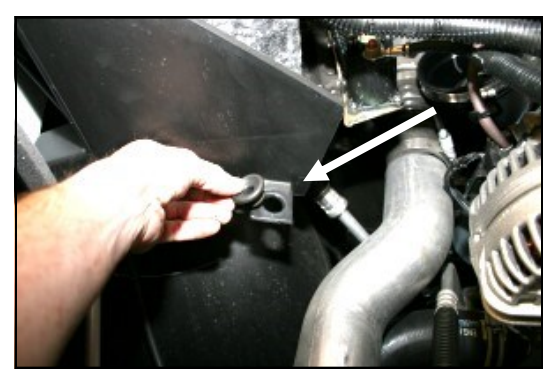
7. Remove the two factory rubber grommets that held the factory airbox base in place.

4. Gently rock the airbox base back and forth while pulling up, to remove it from it's mounting grommets, and remove it from the vehicle.