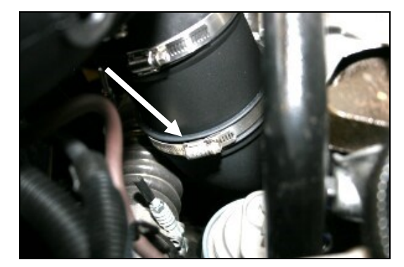
14. Tighten the factory hose clamp where the Airaid metal tube slips into the factory rubber elbow on the turbocharger.