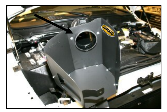
10. Assemble the Cool Air Dam panels as shown using the seven 6-32x5/16" screws (#8), #6 flat washers (#9), and keps nuts (#10). Next install the Airaid filter adapter thru the CAD panel using three 1/4-20x1/2" button head bolts (#11), and 1/4" flat washers (#12). (See Arrow) Apply the Airaid Foil Decal onto the Panel as shown.