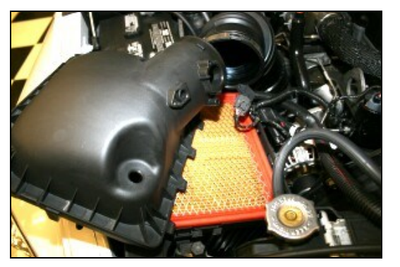
2. Unsnap the two metal clips that hold the airbox lid to the base, and remove the lid. Next, remove the factory paper air filter from the base.