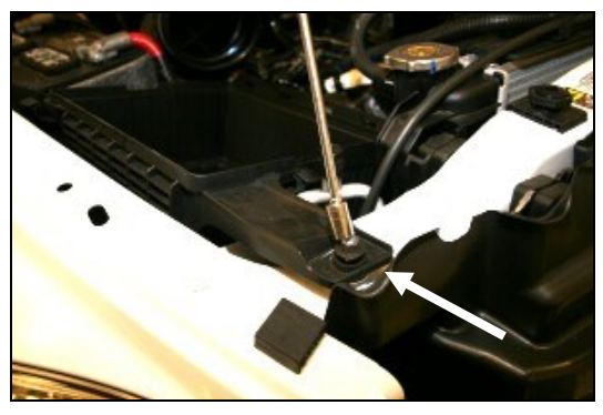
3. Using a 10mm socket, remove the nut that holds the front of the airbox base and grommet assembly to the radiator support.