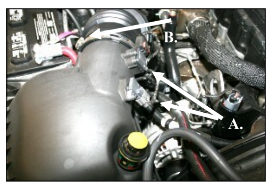
1. Disconnect the negative battery cables. A) Using the supplied #20 Torx bit, remove two screws from the Mass Air Flow sensor, and one screw from the temperature sensor. Remove both sensors and the wiring harness anchor from the airbox lid, and set them aside. C) Loosen the hose clamp that holds the factory intake tube to the airbox lid.

Full color instructions can be viewed on our web site at Airaid.com.