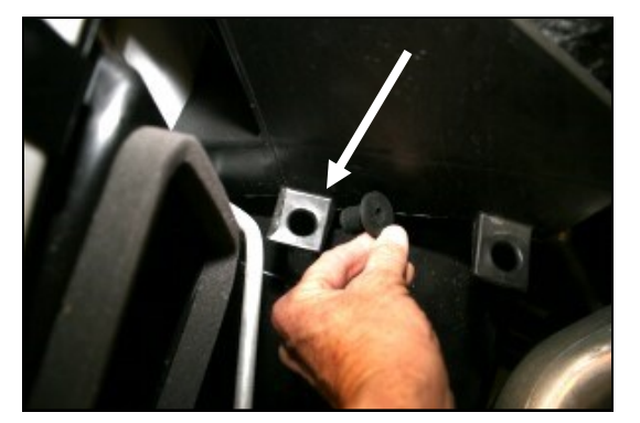
8. Install the supplied well nut (#21) into the support bracket hole that is closest to the fender.

5. Loosen the factory hose clamp at the base of the factory plastic intake tube assembly, and remove the tube from the vehicle.