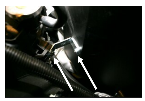
12. Using one 1/4-20x1/2" button head bolt (#11), 1/4" flat washer (#12), and 1/4" serrated nut (#13), and the 8x1.25x30mm hex bolt (#14), and 5/16" flat washer (#15), mount the supplied bracket (#19) between the CAD panel, and the fan shroud mounting boss as shown. Tighten all CAD mounting bolts at this time.