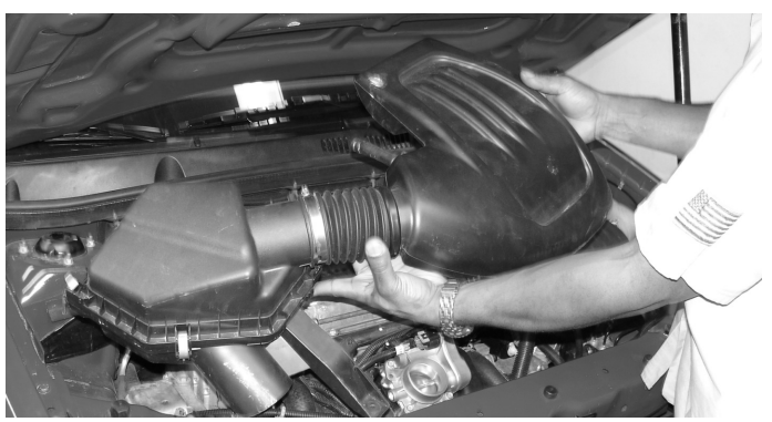
Once the stock clamps have been loosened remove the entire air intake box from the engine compartment.