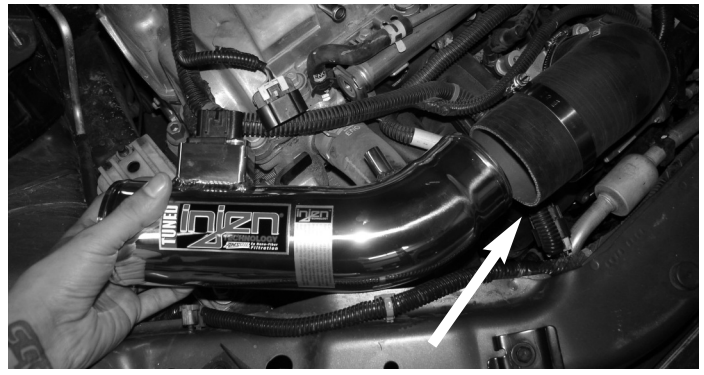
Take the primary intake and press the end into the hose on the throttle body. Position for best possible fit.