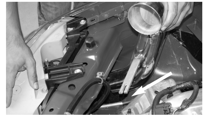
Take t the secondary intake and insert it into the resonator opening.