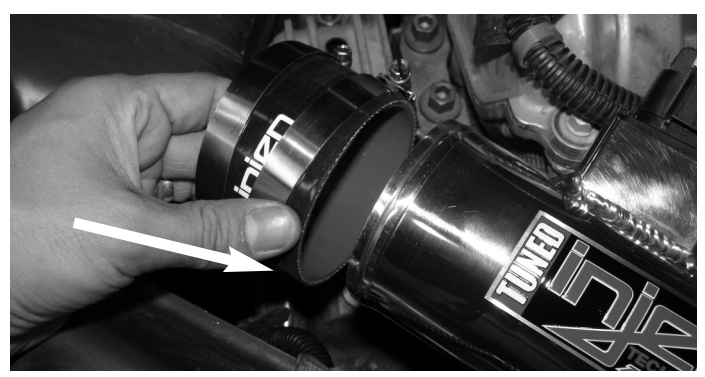
To convert your intake system into a cold air intake take the 3" straight hose and press it over the end of the primary intake. Use two clamps from the kit to place them over the hose and tighten the clamp on the intake.