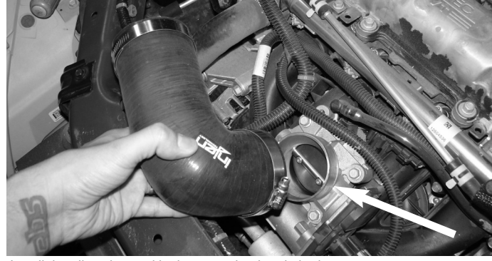
Install the elbow hose with clamps to the throttle body.