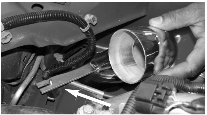
Once the secondary intake has been inserted into the resonator opening align the bracket to the vibra-mount stud.