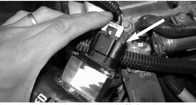
Locate the stock harness clip and plug it into the MAFS. Press the harness into the sensor until you here it snap in place.