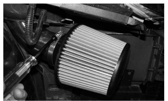
Press the Injen filter over the end of the secondary intake. Press the filter over the intake until it butts up against the stops built inside of the filter neck. Do not over run the intake end past the filter stop, this may obstruct the air flow if incorrectly installed.