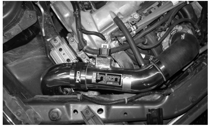
Once the cold air intake has been installed align the entire intake for best possible fit. Make sure there is no rubbing parts along the length of the intake then continue to tighten all nuts, bolts and clamps. Periodically, check the alignment to avoid any damage to the intake system.