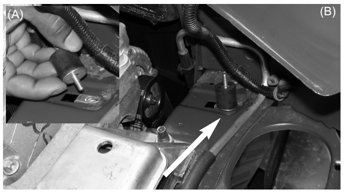
Install the vibra-mount (A). Place the vibra-mount into the pre-tapped hole and turn the vibra-mount into the tapped hole until it bottoms out (B).