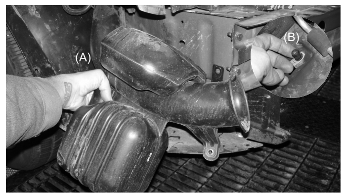
Remove the front bumper cover. With 10mm socket and ratchet, remove the resonator box from the vehicle (A). Remove the air box fitting, this will allow for the vibra mount to be secured (B).