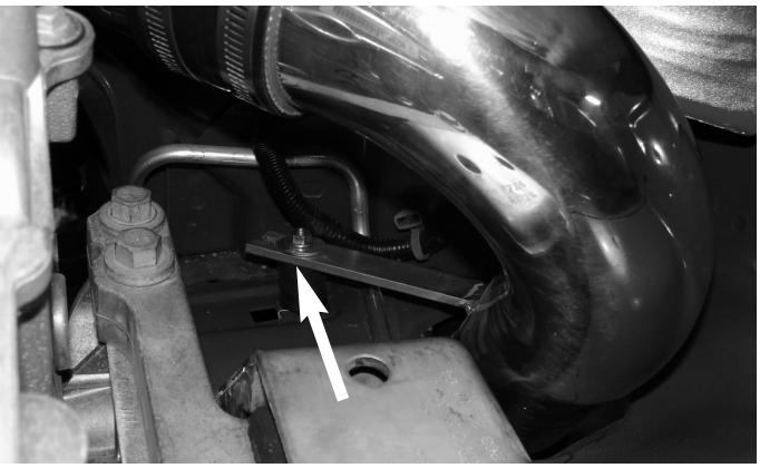
Take the 6mm flange nut and fender washer and secure the intake bracket to the vibra-mount stud.