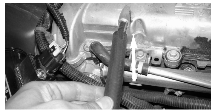
Replace the hose with the new provided 12mm hose .