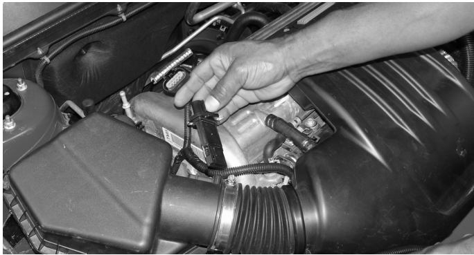
Remove the mass air flow sensor from the stock air intake box. Set the sensor to one side to be used later in the instruction.