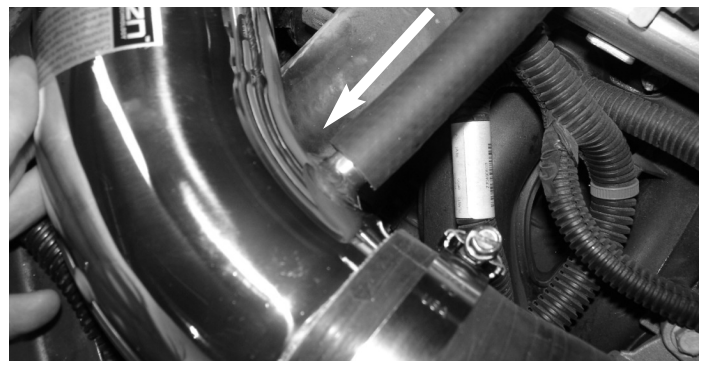
Take the 7" 12mm heat hose and press one end over the crankcase port and the other end over the intake port.