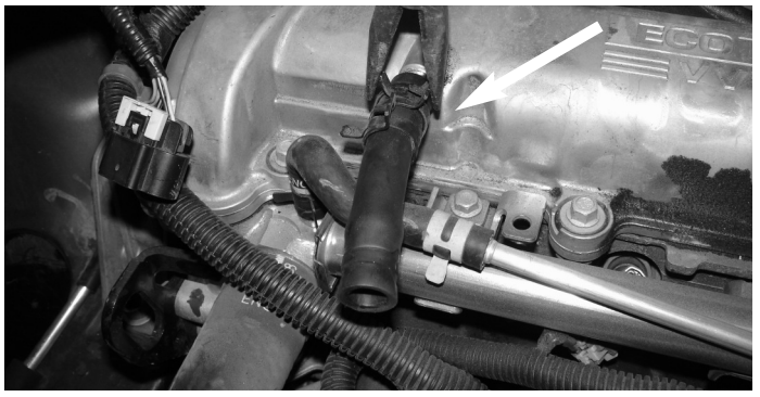
Remove the stock crank case hose from the engine.