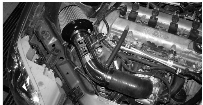
Tighten all clamps using 8mm nut driver. The short ram is now fully installed and ready to go.