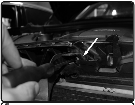
5. The other bolt will be located bhind first bolt holding in plastic shroud. This will now have access to the remaining bolt.