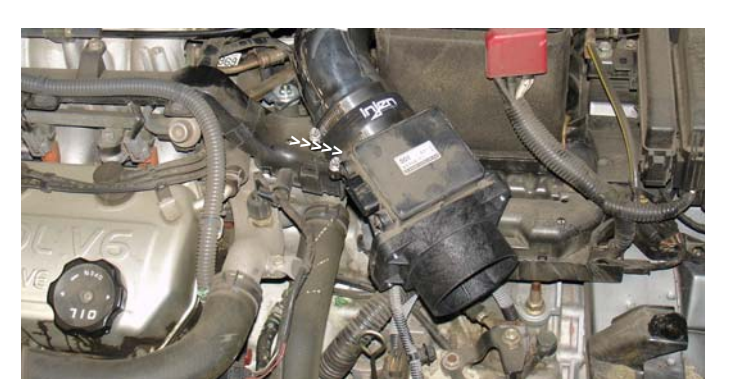
Take the assembled MAFS and press the outlet end into the 3 1/4" hose on the intake. Locate the MAFS for best fit and semi-tighten the large clamps used.