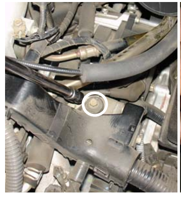
Remove the 6mm bolt seen in this picture. This is where the vibra-mount will be located.