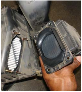
Remove the 4-6mm nuts from the studs holding the MAFS to the air intake box as seen in the picture above.