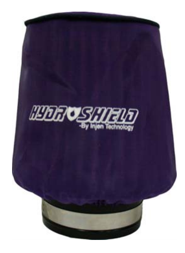
Hydro Shield Sold Separately