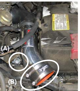
Use the 6mm flange nut and fender washer to secure the intake to the vibra-mount (A). Press the 3 1/4" hose over the intake, use two clamps and tighten the clamp on the intake (B).