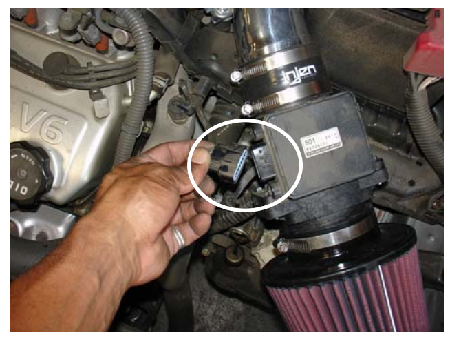
Reconnect the electrical mass air sensor harness prior to starting the engine.