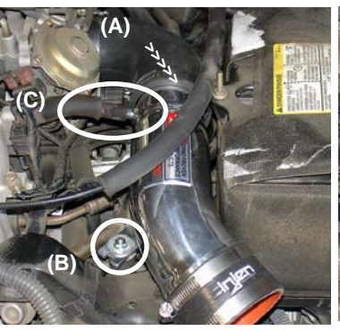
Once the intake has been pressed into the elbow on the throttle body (A) Align the intake bracket to the vibra-mount stud (B). Press the stock vacuum line over the intake port (C).