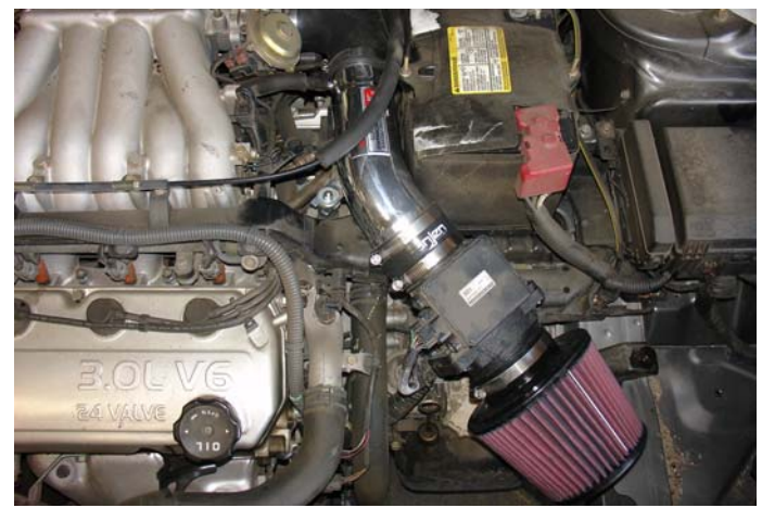
Align the entire intake for best possible fit. Check all lines, hose and fitment prior to tightening all nuts, bolts and clamps. Periodically, check the fitment of the intake and make sure it is not rubbing or hitting any moving parts.