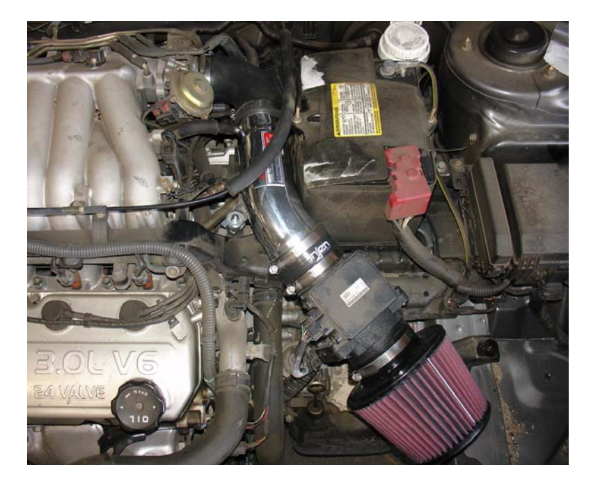
Now available, Hydro Shield by Injen Part Number X-1033

Parts and accessories are available on line at "Injenonline.com"