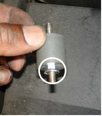
Take one of the 6mm flange nuts and place it on one end of the vibra-mount until it bottoms out.