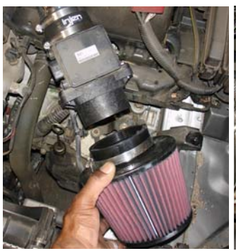
Press the 3 1/2" filter neck over the end of the composite flange.