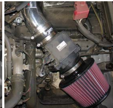
With the filter properly in place, align the intake for best possible fit.