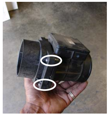
Take the finned composite flange, butt it up to the flat surface of the MAFS. Use the 4-6mm flange nuts to bolt the flange to the MAFS.