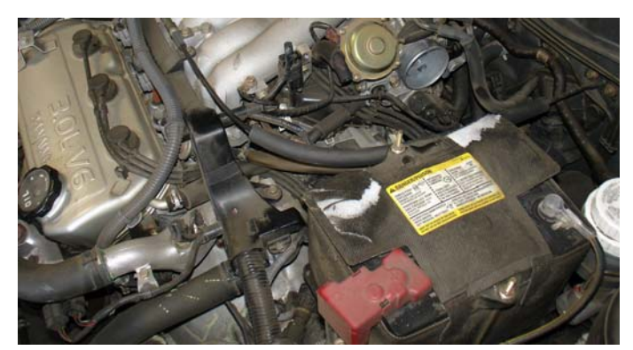
Engine compartment after the air intake box, ducts and air scoop have been removed.