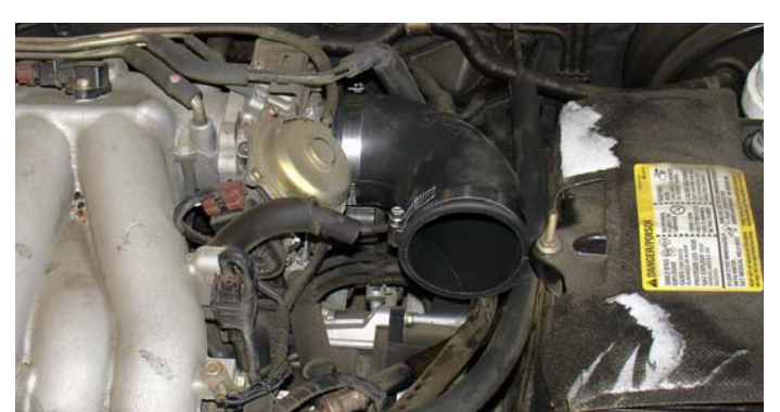
Take the 90 degree elbow and press the end with the velocity stack over the throttle body. Place a medium clamp (.048) on each side of the elbow and semi-tighten the clamp on the throttle body side.