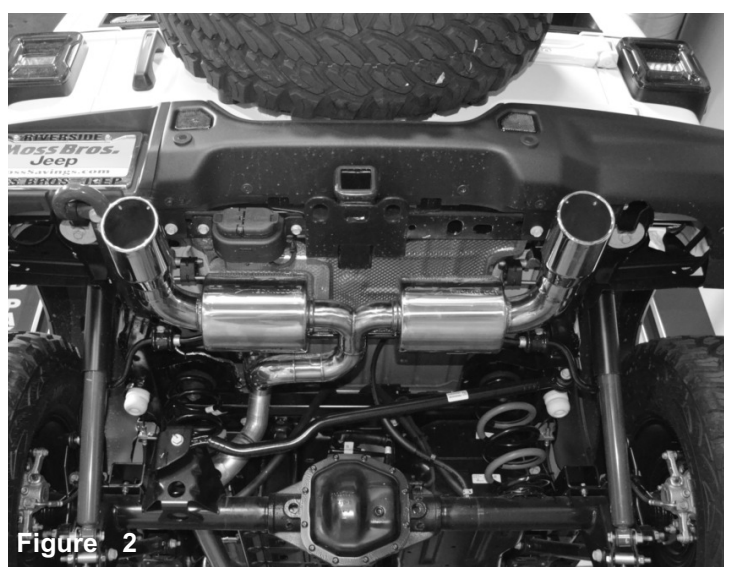
Make sure the hangars on installed to both the factory isolators. Position for the best fit. Rotate if necessary. Tighten the torsion clamp using 17mm socket and ratchet. Re-tighten after 50miles and verify the clamp is securred. Congratulations! You have just completed the installation of this intake system. Periodically, check the alignment of the exhaust. Note: Check clearance and adjust if needed! Failure to check the alignment and adjust the exhaust can cause damage that will void the warranty. Injen Technology is not responsible for any damages caused by/from improper installation.