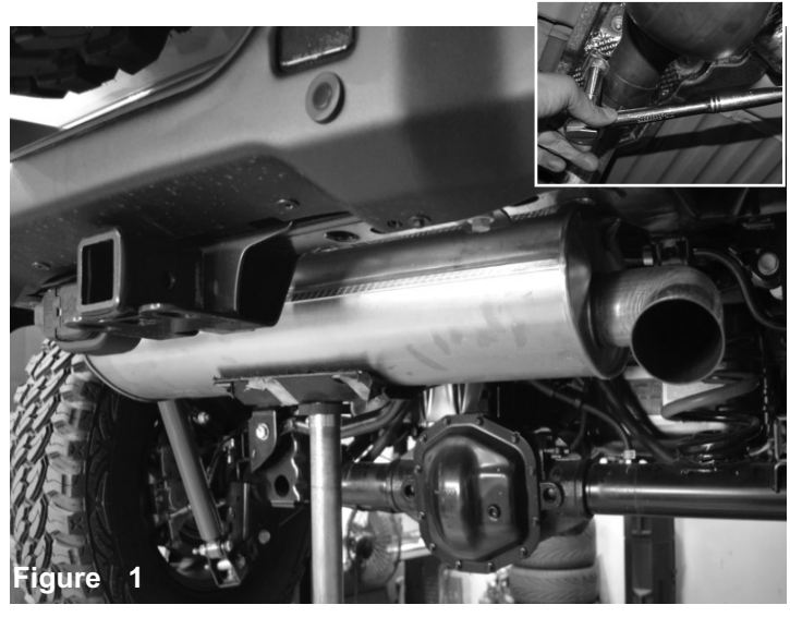
Remove the stock muffler using 15mm socket and wrench. Remove the hangars from stock isolators. Install the new Injen Axle Back Exhaust. Position the hangars to the stock isolators. Use Provided #63 torsion clamp in the kit. Position for the best to have access to the 17mm nut on clamp. Do not tighten. Install the Chrome tips to the exhaust adjust and fit to desired position and tighten.

Please check with your local and state law enforcement agencies for exact regulation requirements.