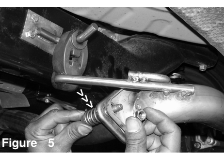
align the flange to the stock donut flange and use the stock spring loaded bolts and m10 nuts supplied.