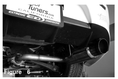
Align the entire axle-back for best fit and tighten the nuts and bolts, keep tip away from the bumper.