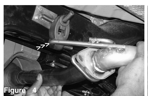
Push the second hanger near the flange into the second grommet as shown above.

Raise the axle-back in place and insert the first hanger on the existing rear grommet.