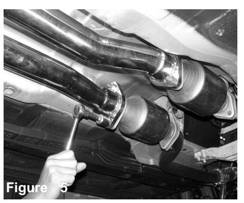
Secure the flanges using the factory nuts.