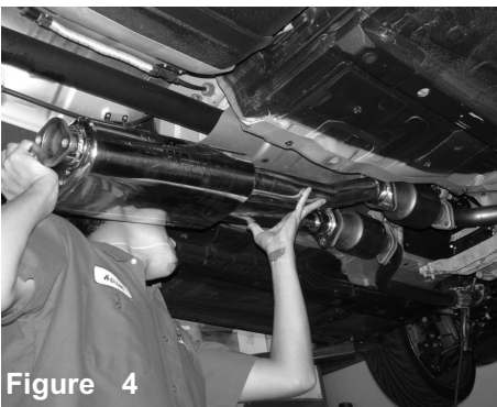
Install the midsection with the two tubes attached to it to the factory catalytic converters.