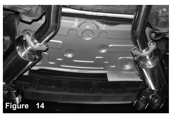
Rear muffler section secured to mid-pipe sections. Make your final adjustment and make sure you have clearance with no iterference with the bumper or chassis components. you may now Tighten all the bolts supplied once all adjustment have been made and then recheck again.