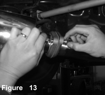
After the gasket is in place. Insert two M10 bolts with nuts to secure the flanges together on both drivers side and passenger side. Leave these nuts and bolts loose for now.