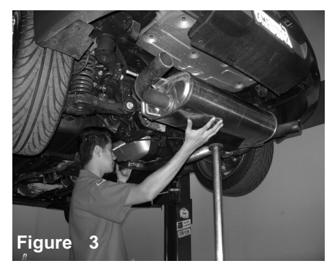
Remove the entire stock exhaust from the Catalytic converter.