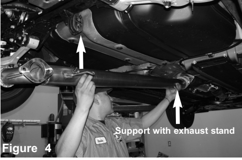
Position the Injen Mid-Y pipe into postion. Place the mid hanger onto the grommet. Make sure you support the front of the exhaust pipe with a exhaust stand.