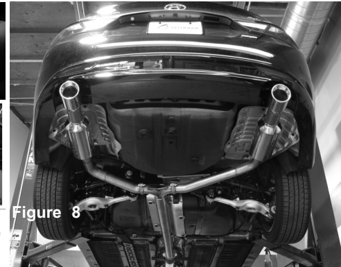
Make sure nothing comes into contact with any component and then make your final adjustments to the entire exhaust system. Use a 14mm socket and rachet secure all the

Congratulations! You have just completed the installation of the Injen Cat-back system. Periodically, check the alignment of the exhaust, normal heat cycles can cause nuts and bolts to come loose. Failure to check the alignment and adjust the exhaust can cause damage that will void the warranty.