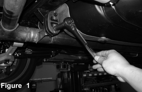
Use a 12mm socket and rachet to remove the 12mm bolt on the center hanger located near the stock exhaust "Y"