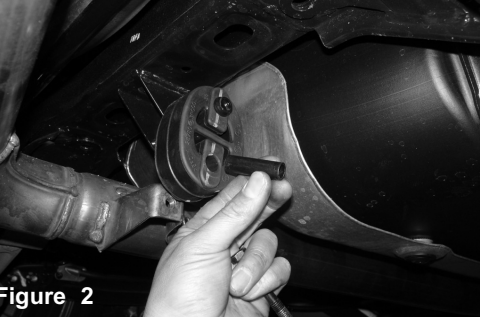
Pull the spacer out of the exhaust grommet from figure 1