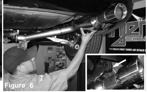
Once the mid-pipe is in place. Position the right side muffler section into the right side bumper cavity and then hang the muffler on the grommet.