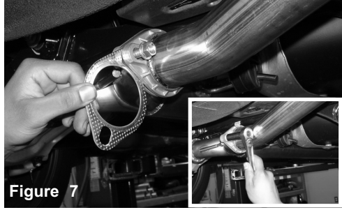
Place one supplied 60mm gasket and two M10 nuts and bolts connecting the right side muffler section flange to the mid-pipe flange. Use a 14mm rachet and socket to snug the two M14 nuts and bolts for now. Do not tighten them. Repeat this process for the left side muffler section.