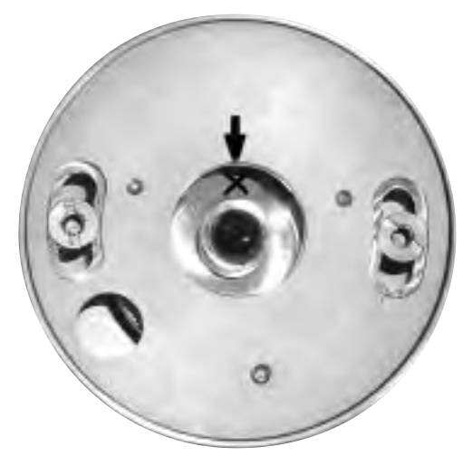
NOTE: Arrow and X in photo have been enlarged for clarity.