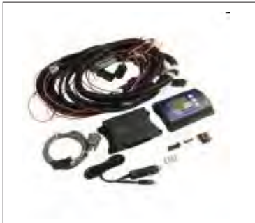
B&M Shift Plus 2 Transmission Controller #120001

NOTE: Complement your B&M TransKit with some of the following products. Check the B&M website at www.bmracing.com for various options: