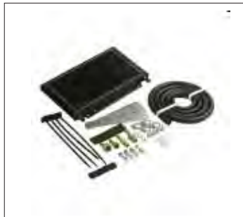
B&M Transmission Oil Cooler #70264 (SuperCooler) #70297 (Hi-Tek Cooler)