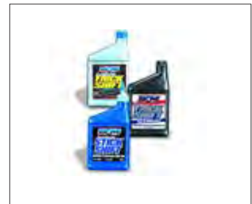
B&M Trick Shift™ (For Pre-2000 vehicles) #80286