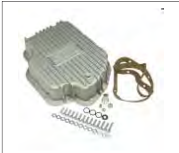
Cast Aluminum Deep Pan (Adds 3 qt.) #70295 For 4L80E 1993-1998