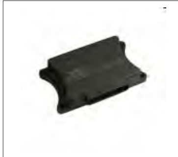
B&M Remote TPS (Must be used with #120001) #120002