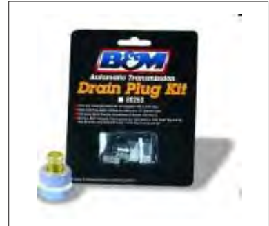
B&M Drain Plug Kit #80250