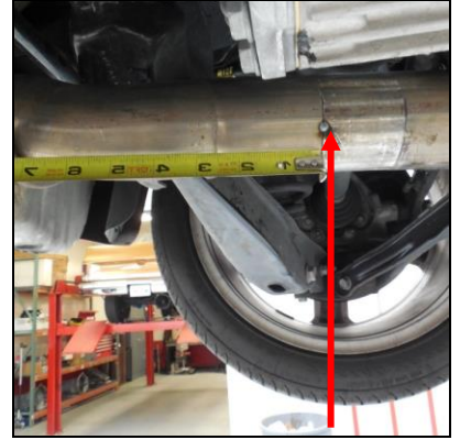
Figure 2 Passenger's Side