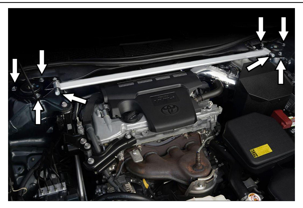
3. Install the strut bar assembly using the provided (6) M10 flange nuts. Then, tighten the preinstalled nuts and bolts holding the strut bar and the strut bar brackets together.