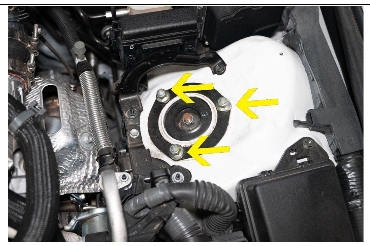
3. Remove the strut tower nuts from the left and right strut towers using a 14mm socket.