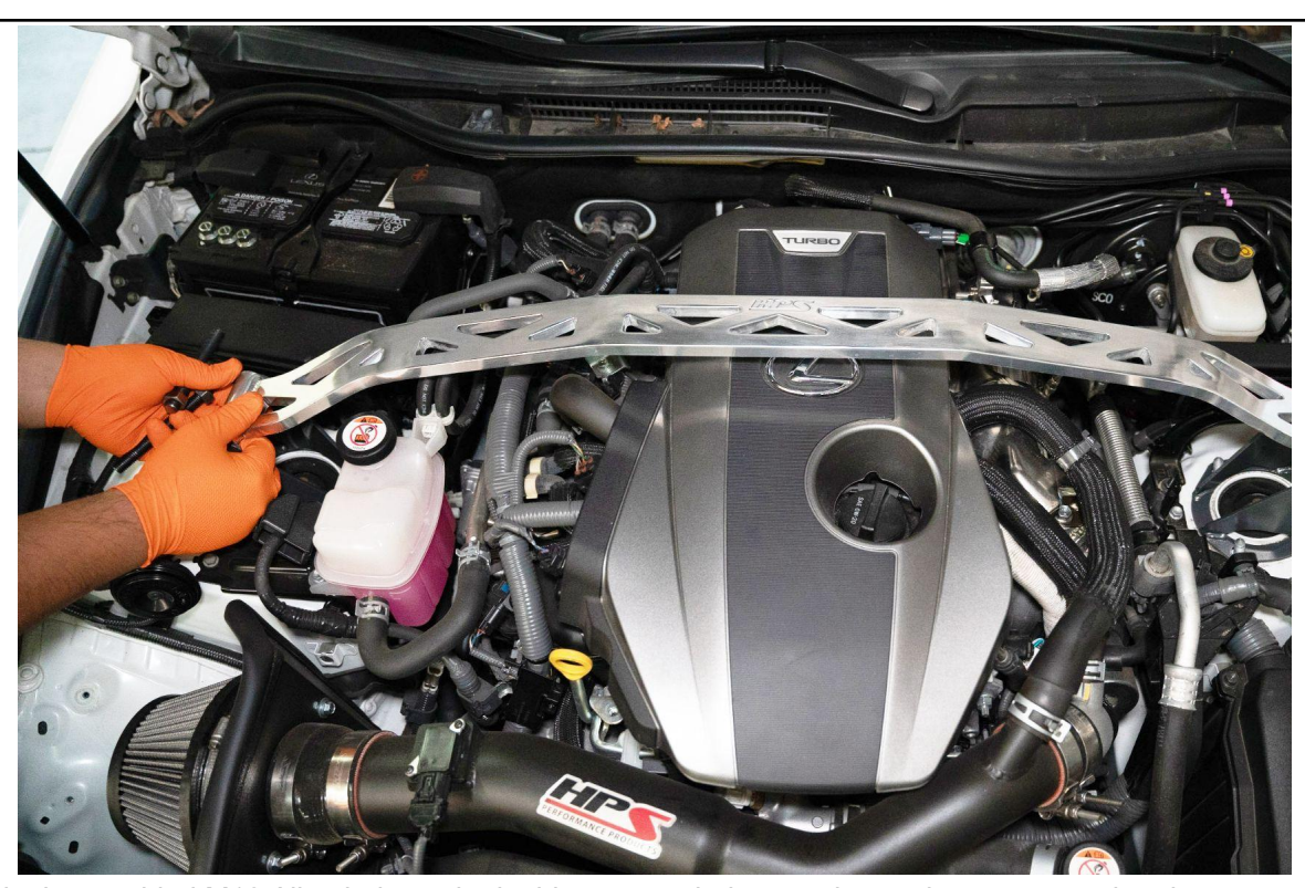
6. Slide the provided M12 Allen bolts on both sides to attach the strut bar to the strut tower brackets.