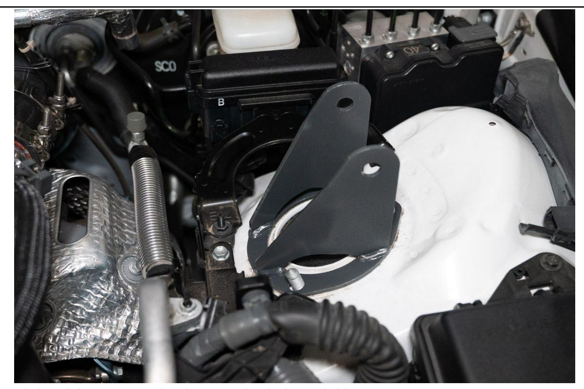
5. Loosely install the strut tower brackets onto the designated sides.