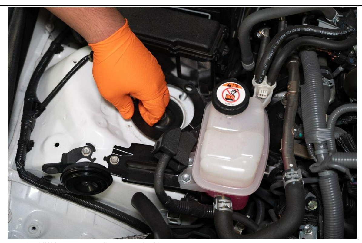
4. Remove the OEM strut tower plate on each side.

NOTE: THE HPS STRUT BAR WILL NOT INSTALL PROPERLY IF THE STOCK PLATES ARE NOT REMOVED.