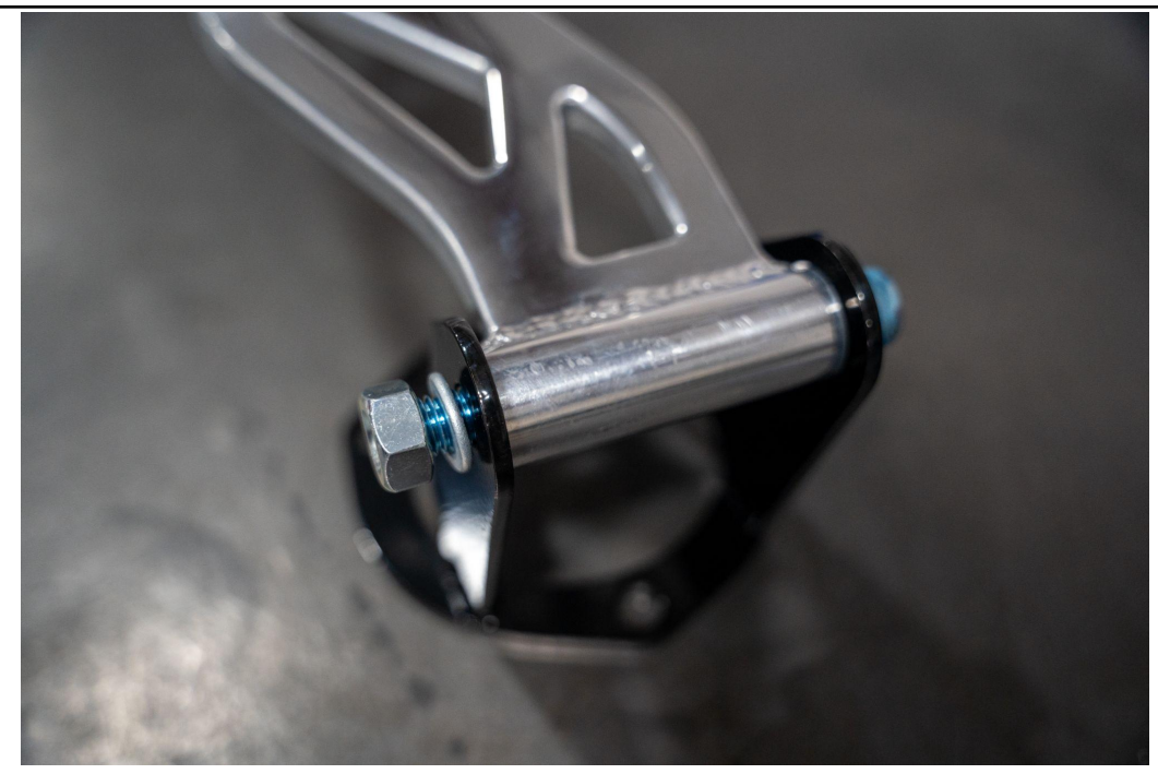
9. Torque down the M12 Allen bolts and the M12 nuts to 80 ft-lbs.