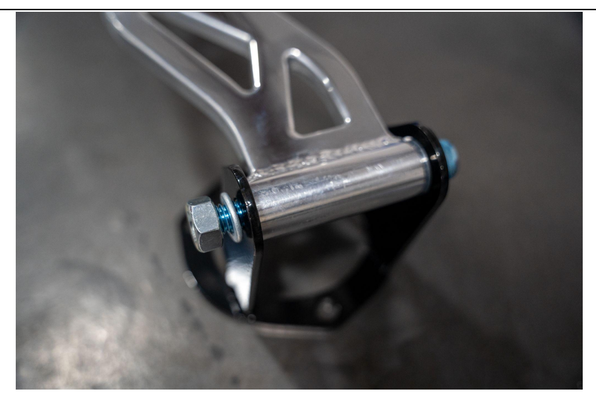
7. Thread on the provided M12 split lock washers first and then M12 nuts onto the backside of the M12 bolts.