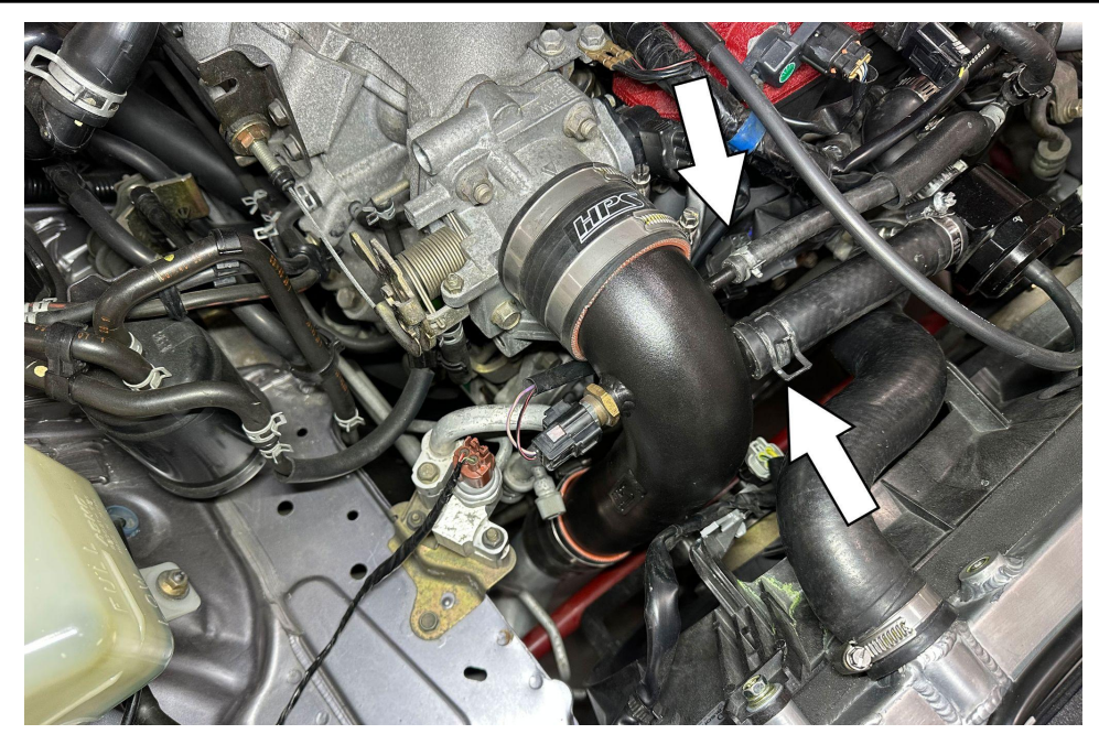
7. Connect the vacuum hose and the blow off valve recirculation hose to the HPS intercooler pipe.