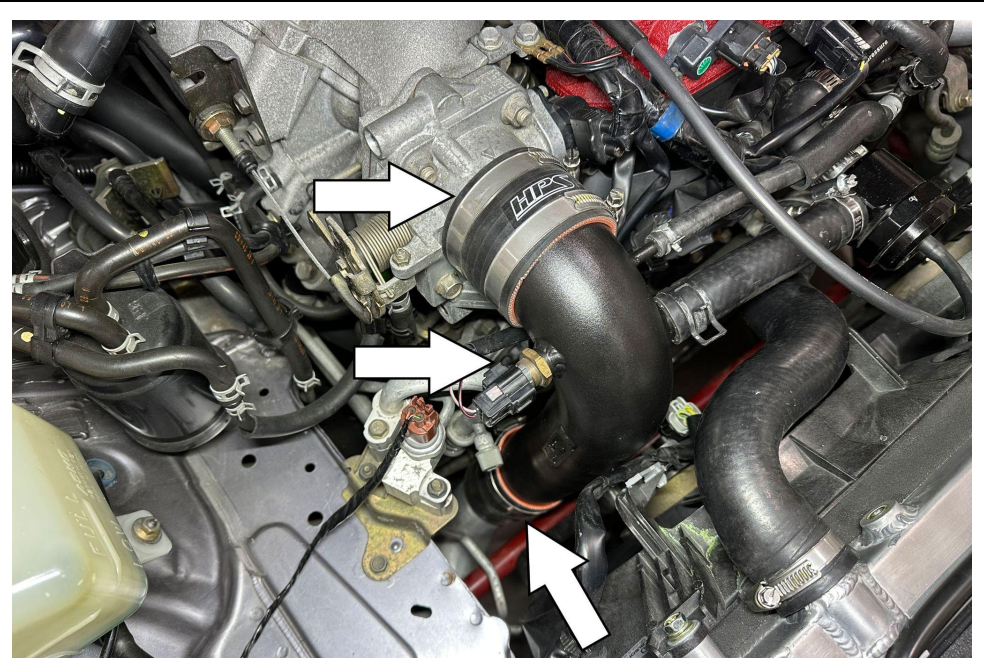
6. Slip the HPS intercooler pipe with couplers over the throttle body and lower intercooler pipe before tightening all four clamps. Install the intake air temperature sensor onto the HPS pipe using the original crush washer and then plug in the sensor harness.