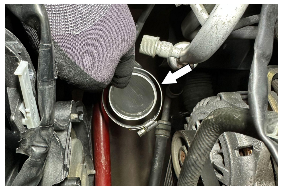
5. Loosely place the clamp onto the lower intercooler pipe. This clamp will be tightened once the HPS intercooler pipe is in place.