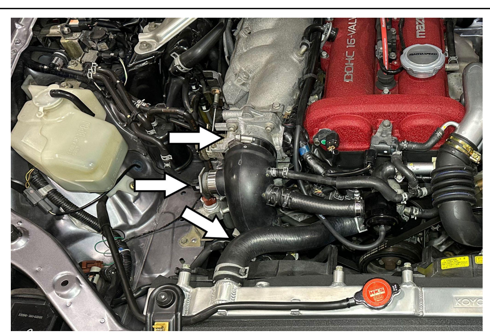
2. Loosen the top and bottom factory throttle body intercooler pipe clamps. Then unplug the intake air temperature sensor.

NOTE: Disconnecting the negative battery cable erases pre-programmed electronic memories. Write down all memory settings before disconnecting the negative battery cable. Some radios will require an anti-theft code to be entered after the battery is reconnected. The anti-theft code is typically supplied with your owner's manual. In the event your vehicle's anti-theft code cannot be recovered, contact an authorized dealership to obtain your vehicle's anti-theft code. We also highly recommend NOT discarding any stock parts after the installation.