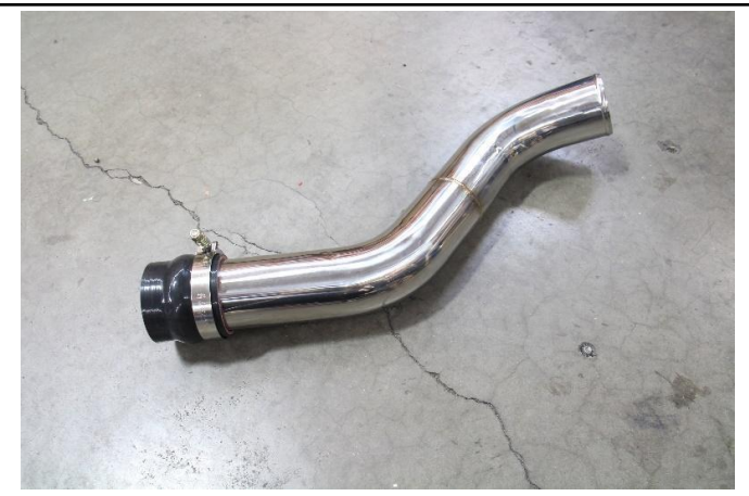
7. Install the hump coupler onto the long side of the hot side charge pipe.