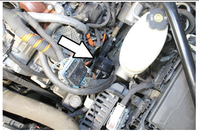
8. Carefully insert the hot side charge pipe to the intercooler inlet.