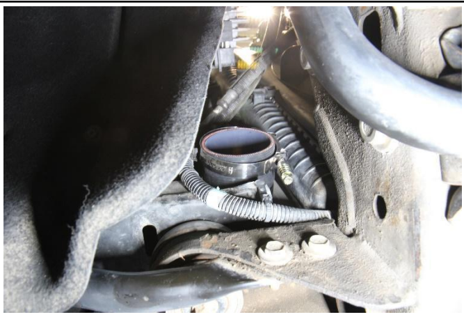
6. Install the other reducer coupler along with the provided T-bolt clamps onto the intercooler inlet.