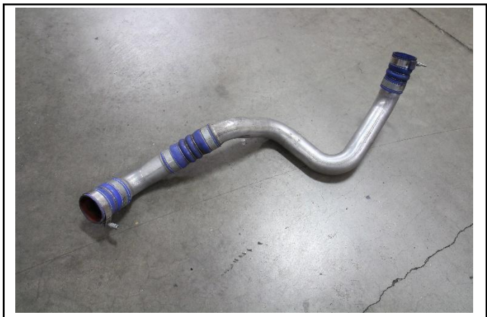
4. With an assistant, remove the hot side charge pipe by guiding the pipe towards the top.