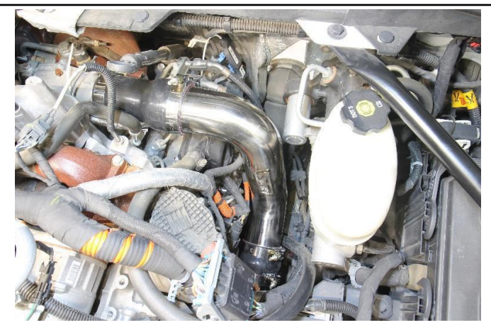
9. Insert the T-bolt clamp onto the hump coupler and install the remaining hot side charge pipe into the vehicle.