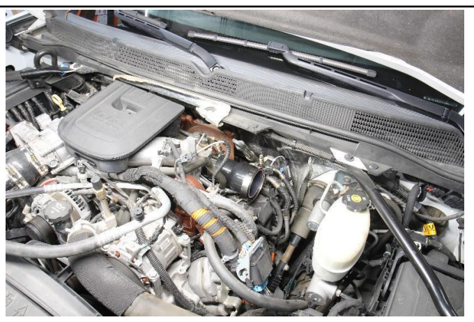
5. Install the long reducer coupler, along with the provided T-bolt clamps onto the turbo outlet.