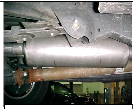
3 INSTALL MUFFLER # B ONTO HEADPIPE 1 ½" TO 2". USE CLAMP # F TO SECURE MUFFLER TO HEADPIPE. DO NOT TIGHTEN. USE A JACK