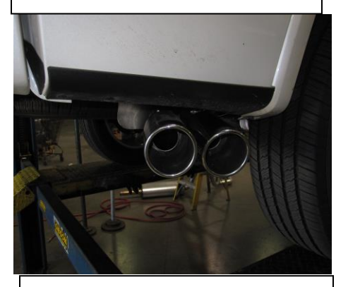
7. Be sure to check all clearance after each section has been tightened to be sure there is proper clearance. It may take 4-500 miles for your vehicle to fully adjust to the changes in exhaust flow.

"MAKE SURE YOU HAVE A 1" CLEARANCE ON ALL PIPES FROM ALL RUBBER BRAKE LINES, SHOCK BOOTS, TIRES, ETC..." TORQUE ALL CLAMPS TO APPROX. 100 TO 150 FT LBS.