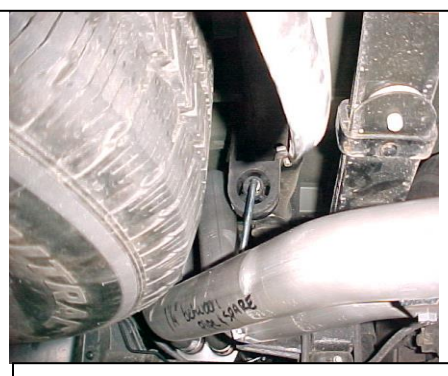
4 INSTALL PASS. SIDE TAILPIPE # C INTO MUFFLER 1 ½" TO 2". INSERT HANGER INTO RUBBER GROMMET, USE CLAMP # G TO SECURE PIPE TO MUFFLER. DO NOT TIGHTEN.