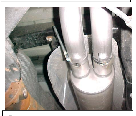
5. INSTALL DRIVERS SIDE TAILPIPE # D INTO MUFFLER 1 ½" TO 2". INSERT HANGERS INTO RUBBER GROMMETS, USE CLAMP # G TO SECURE PIPE TO MUFFLER. DO NOT TIGHTEN.