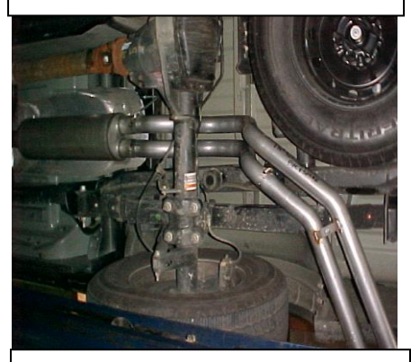
6. THE TAB ON DRIVER SIDE PIPE SHOULD GO UNDERNEATH THE PASSENGER SIDE PIPE TAB. USE BOLT KIT # H TO SECURE TOGETHER.