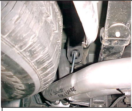
4 INSTALL PASS. SIDE TAILPIPE # C INTO MUFFLER 1 ½" TO 2". INSERT HANGER INTO RUBBER GROMMET, USE CLAMP # G TO SECURE PIPE TO MUFFLER. DO NOT TIGHTEN.