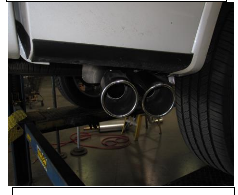
7. Be sure to check all clearance after each section has been tightened to be sure there is proper clearance. It may take 4-500 miles for your vehicle to fully adjust to the changes in exhaust flow.

"MAKE SURE YOU HAVE A 1" CLEARANCE ON ALL PIPES FROM ALL RUBBER BRAKE LINES, SHOCK BOOTS, TIRES, ETC..." TORQUE ALL CLAMPS TO APPROX. 100 TO 150 FT LBS.