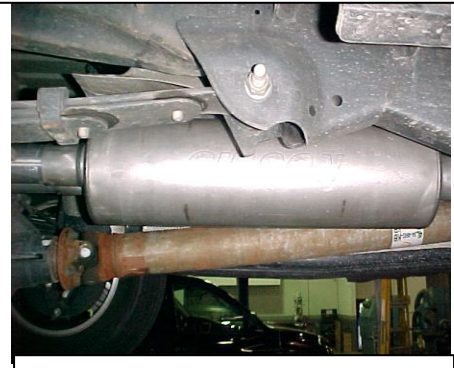
3 INSTALL MUFFLER # B ONTO HEADPIPE 1 ½" TO 2". USE CLAMP # F TO SECURE MUFFLER TO HEADPIPE. DO NOT TIGHTEN. USE A JACK