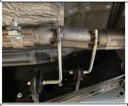
2. INSTALL HEADPIPE #A ONTO STOCK FLANGE. INSERT WELDED HANGER INTO RUBBER GROMMET. USE BOLT KIT PROVIDED TO SECURE. DO NOT TIGHTEN

1. Disconnect the negative battery cable before removal of the OEM Exhaust. This will allow the computer to reset and recognize the new exhaust. Lay out the exhaust on the floor so it looks like the drawing and compare parts with manual. Remove the factory exhaust by cutting behind the factory muffler. Once the tail pipe has been removed un-bolt the muffler and head pipe at the clamp located in front of the factory muffler. Use wd-40 or another type of penetrating oil to remove the rubber grommets. Do not damage these they will be re used.