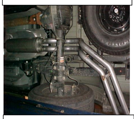
6. THE TAB ON DRIVER SIDE PIPE SHOULD GO UNDERNEATH THE PASSENGER SIDE PIPE TAB. USE BOLT KIT # H TO SECURE TOGETHER.