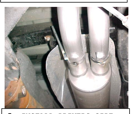
5. INSTALL DRIVERS SIDE TAILPIPE # D INTO MUFFLER 1 ½" TO 2". INSERT HANGERS INTO RUBBER GROMMETS, USE CLAMP # G TO SECURE PIPE TO MUFFLER. DO NOT TIGHTEN.