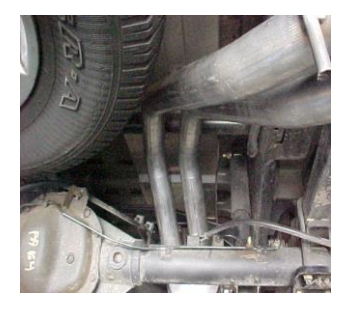
INSTALL PASS. SIDE TAILPIPE # E INTO MUFFLER 1 ½"-2". USE CLAMP # H TO SECURE PIPE TO MUFFLER, DO NOT TIGHTEN.