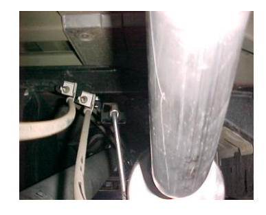
INSTALL BAND CLAMP # I ONTO MUFFLER, INSERT HANGER INTO RUBBER GROMMET, USE BOLT KIT PROVIDED, DO NOT TIGHTEN.

INSTALL MUFFLER # C ONTO YOUR RESONATOR 1 ½" –2". USE CLAMP # G TO SECURE MUFFLER TO THE PIPE, DO NOT TIGHTEN.