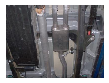
4. Install muffler #B with inlet towards Y-pipe. Use jack stands to support the muffler. Use clamp #F to secure the muffler to headpipe. Do not tighten. Muffler outlets will be level

7. Using clamps #G secure both tailpipes to the outlets of the muffler. Rotate tailpipes to best fit your truck.