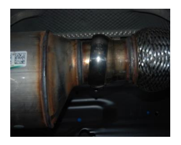
2. To remove stock exhaust, unclamp it at the ball flange behind the Y-pipe. Make sure to leave all rubber grommets in the factory location. You will re-use stock clamp. For easier removal of exhaust, cut behind the muffler. Use WD-40 to remove hangers from grommets.

1. Disconnect the negative battery cable before removal of OEM exhaust. This will allow the computer to reset and recognize the new exhaust. Lay out the exhaust on the floor so it looks like the drawing and compare parts with manual.