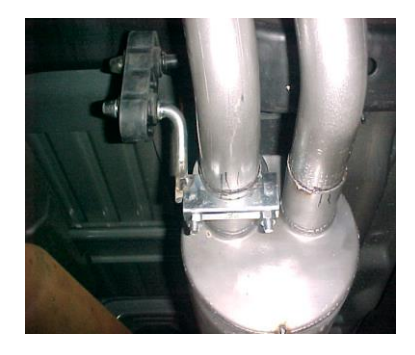
INSTALL REAR MUFFLER HANGER # H ONTO DRIVER SIDE OUTLET OF THE MUFFLER AND INSERT THE WELDED HANGER INTO RUBBER GROMMET.

INSTALL EXIT PIPES # E. USE CLAMPS # G TO SECURE TO THE TAILPIPES. DO NOT TIGHTEN.