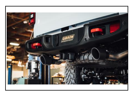
Now go back and tighten all clamps, nuts and bolts. Use stainless steel cleaner weekly to prevent tip from discoloration. Inspect all fasteners after 25-50 miles of operation and re-tighten as necessary.

7. Lastly, install exit pipes (F) and tips (L) onto both Driver side and Passenger overaxle pipes. Position the exit pipes to what meets your expectations.