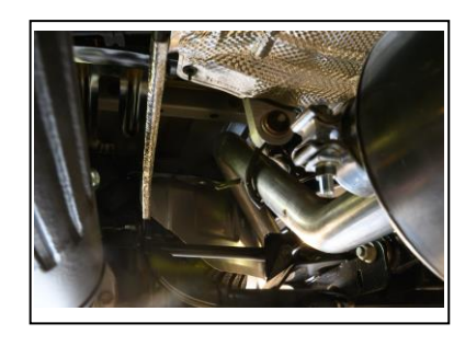
4. Next, install the driver side over axle-pipe #C, Using both clamp# H. The rear hanger will need to slide onto the over axle before you're able to bolt into the frame. Attach using bolt kit #J

5. Continue by installing Passenger Side passenger over-axle pipe (D). Do not tighten using clamp #H to attach to muffler outlet.