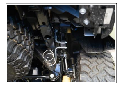
6. Install the Passenger overaxle pipe (E) using clamp (H) and hanger assembly (I). Use one of the body bolts (as shown in picture) and rubber grommet(K). Do not tighten.