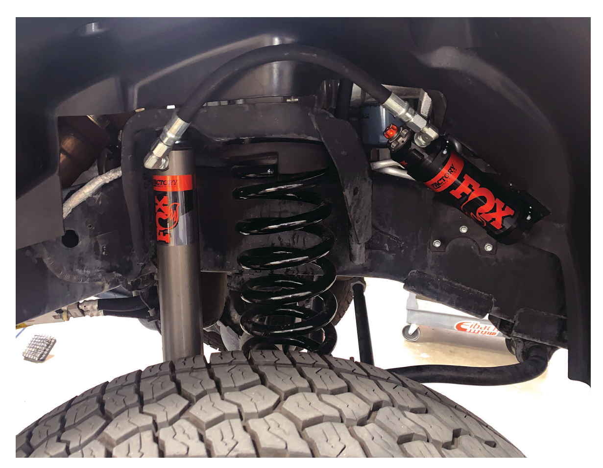
Figure 1: Passenger side shown