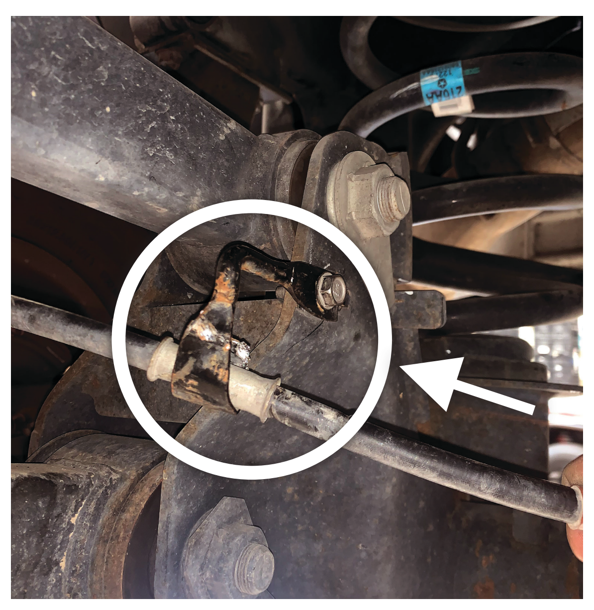
Figure 5: Passenger side shown