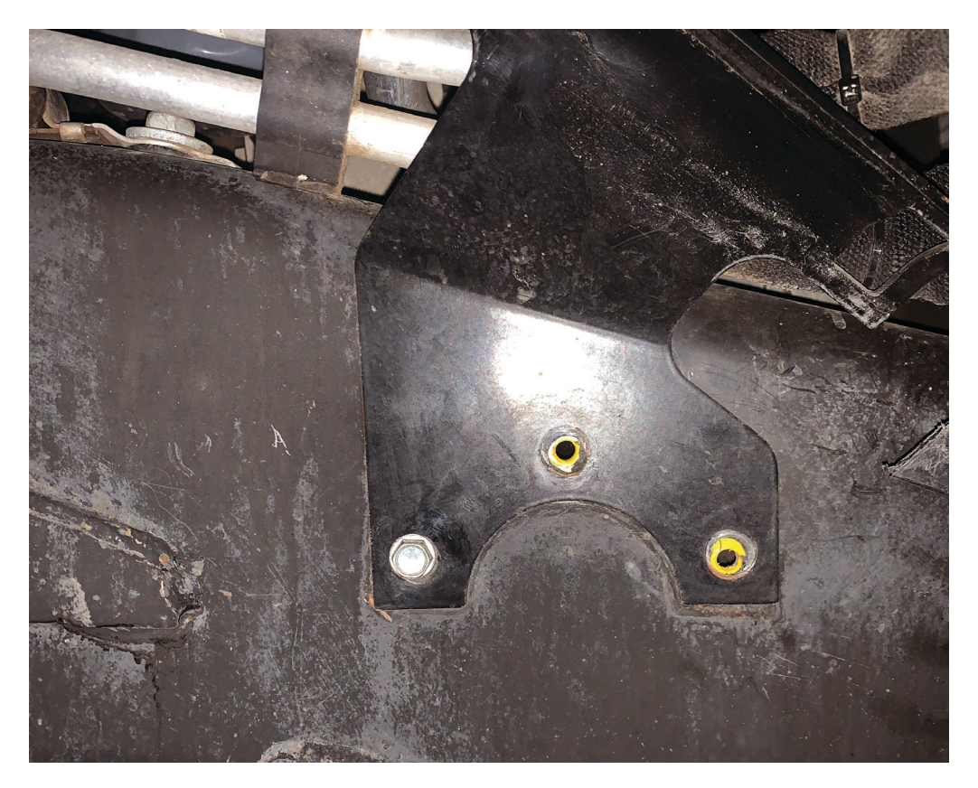
Figure 3: Passenger side shown