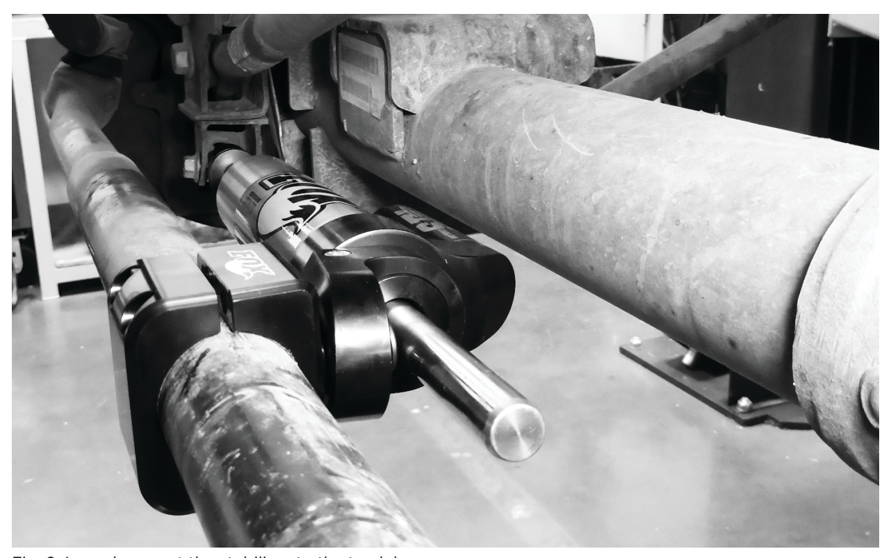
Fig. 2: Loosely mount the stabilizer to the track bar.

6. Loosely mount the Group A clamp to track bar with the Group A fasteners (Fig. 2).