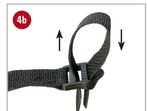
Ribs on buckle should face up. Thread strap through buckle as shown.