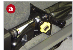
Rotate jack so yellow knob faces outward (as pictured).