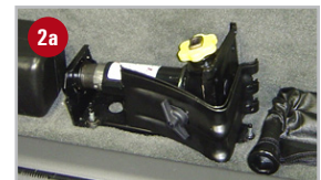
Remove wheel blocks from jack, then loosen jack.