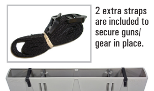
2 extra straps are included to secure guns/gear in place.