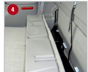
The DU-HA bolts to rear floor flaps to allow access to jack when tilted forward.