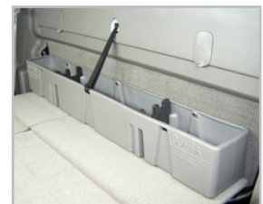
This is how the DU-HA should look installed behind the back seat.